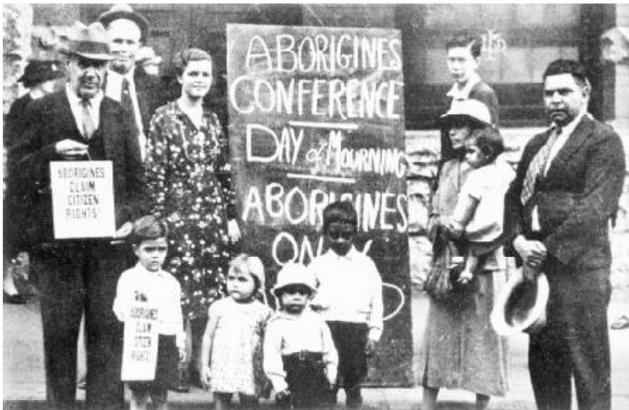
Top: Aboriginal Day of Mourning protest in Sydney, January 26, 1938. Bottom: Far -right “Reclaim Australia” rally, Melbourne, April 3, 2015.