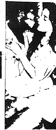
Typical British Movement propaganda