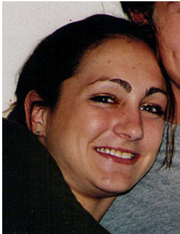
Me, age 17. You can see the effects of bulimia all over my face... Chipmunk cheeks, rotten teeth, sores and sad sunken eyes.