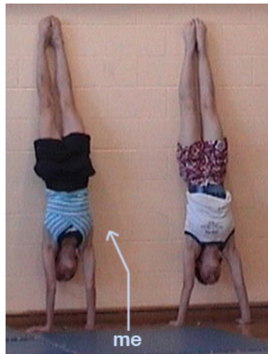
Despite losing so much weight - I lived in hope of just 'Losing a little more'

My world was ruled by restricting calories, and throwing up any food I did consume.