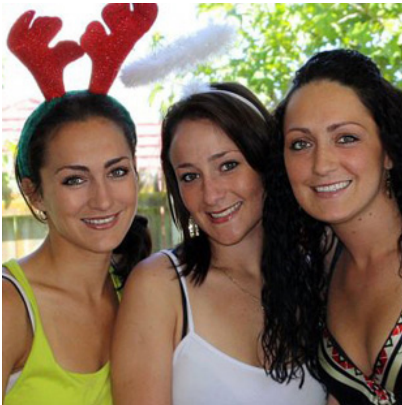
Christmas 2009 with my 2 beautiful sisters. It's amazing to be able to let my hair down and enjoy life to the full! (I'm on the left)

It won't happen over night... It could even take an entire year - like it did for me... But, if you turn to face the direction of health and happiness and take persistent baby steps - you will get there.