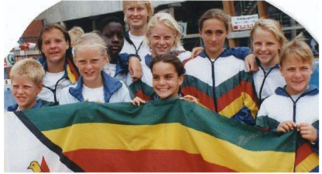
The Zim diving team on tour - I'm 3rd from the left.

But, as I entered my early teens I noticed changes with my body. I was embarrassed to go to training and get in my swim suit.