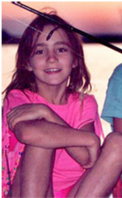
At the age of 8 (Left) bulimia entered my life...