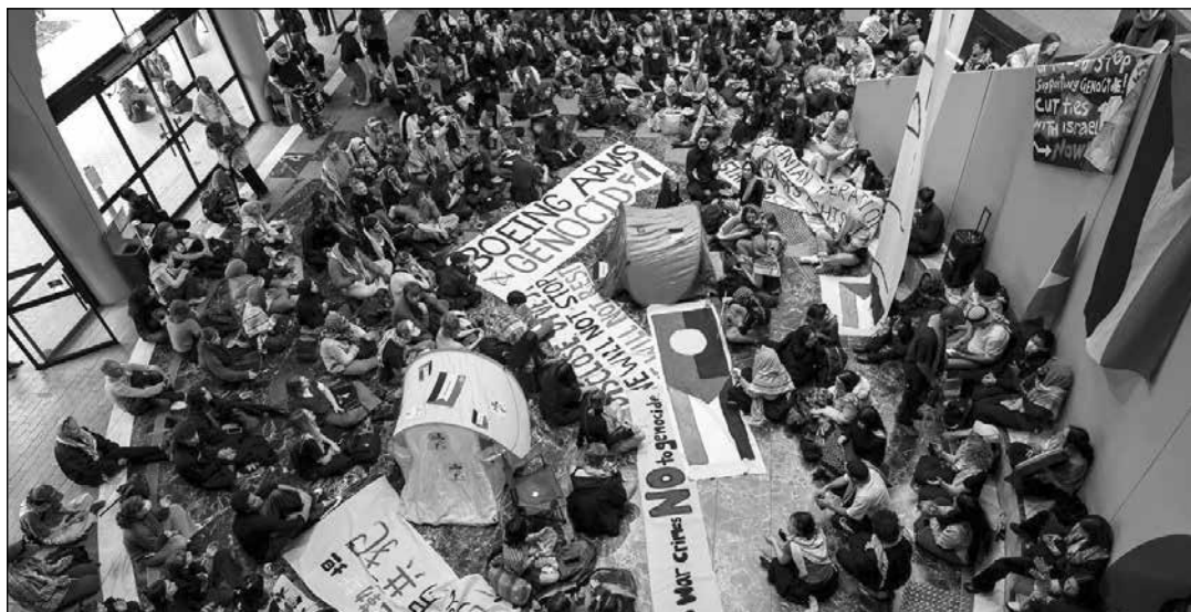
Above: Students at Melbourne Uni occupy the Arts West building

“Connecting what students are doing here with the broader campaign, and making sure there is a much wider layer of student support will be essential for ensuring that we come out of it with a bigger movement for Palestine.”