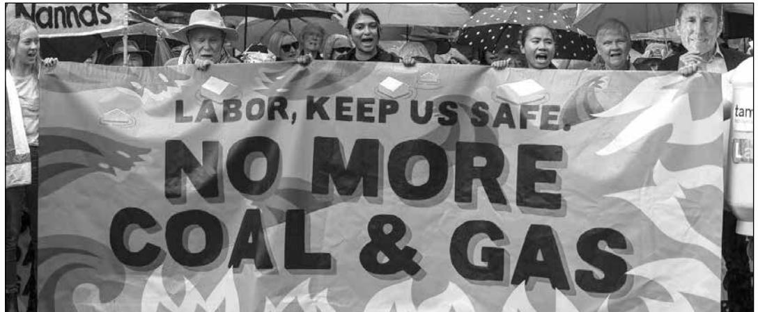
Above: Climate activists protest against new coal and gas projects outside Anthony Albanese’s residence at Kirribilli

used by Scott Morrison and then Energy Minister Angus Taylor that gas is a “transition fuel” that is needed to reduce carbon emissions.