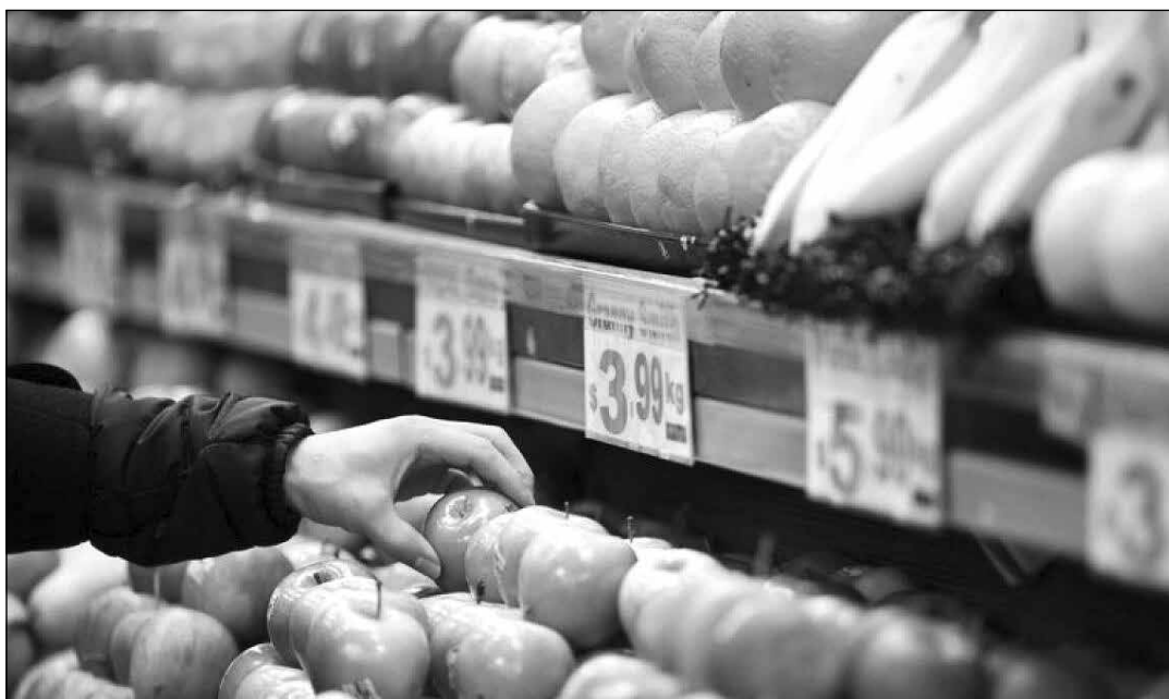
Above: The rising cost of living continues to hit workers

Made in Australia package as a way to drive the clean energy transition, the level of spending involved is modest. Over the next four years it averages just $662 million a year.