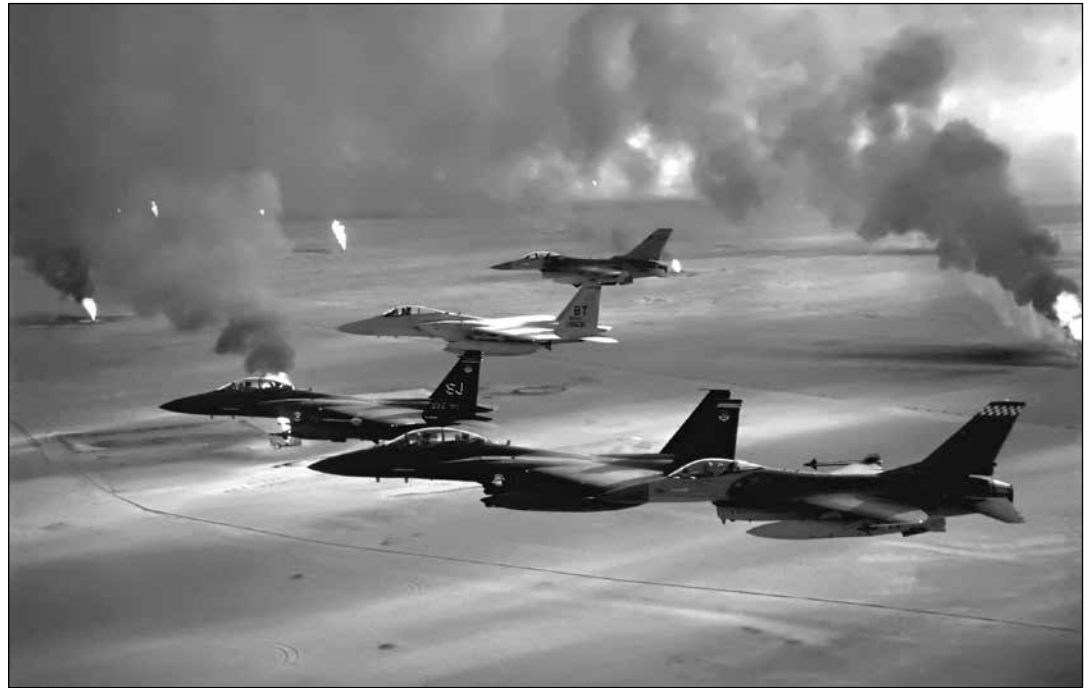
Above: US air force jets fly over burning oil fields in Kuwait during the 1991 Gulf War

dead, unleashed vicious sectarianism, and reduced the whole country to ruin.