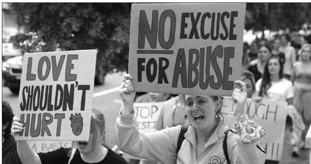
Above: Marches against violence against women have been held across the country