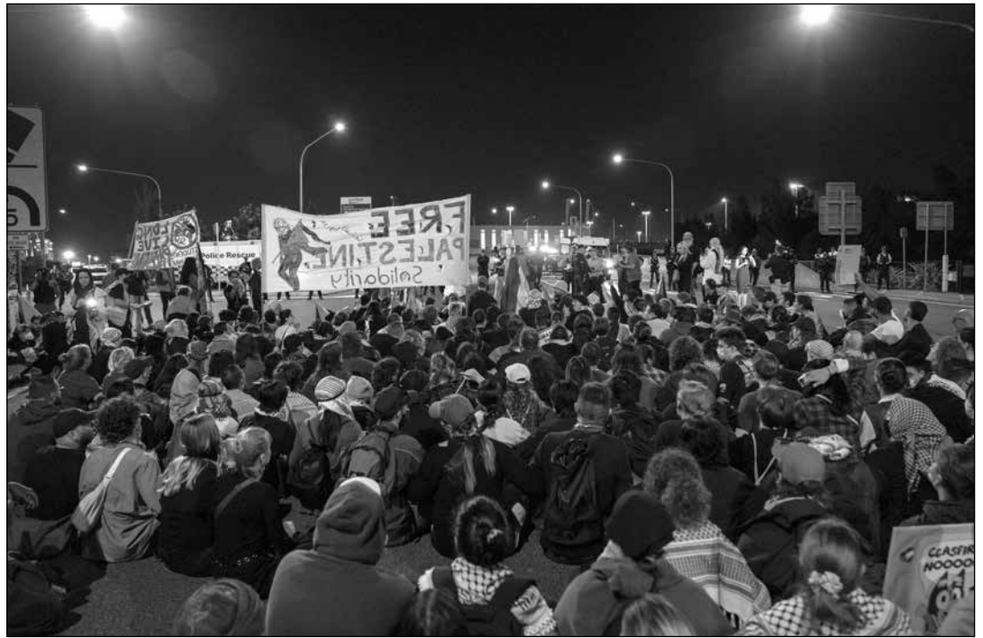
Above: Mass direct action at ZIM shipping has helped put the call for sanctions against Israel on the agenda

Workers have often refused to work on particular contracts or projects in the past, from bans on uranium mining to bans on Indonesian companies during the crisis over East