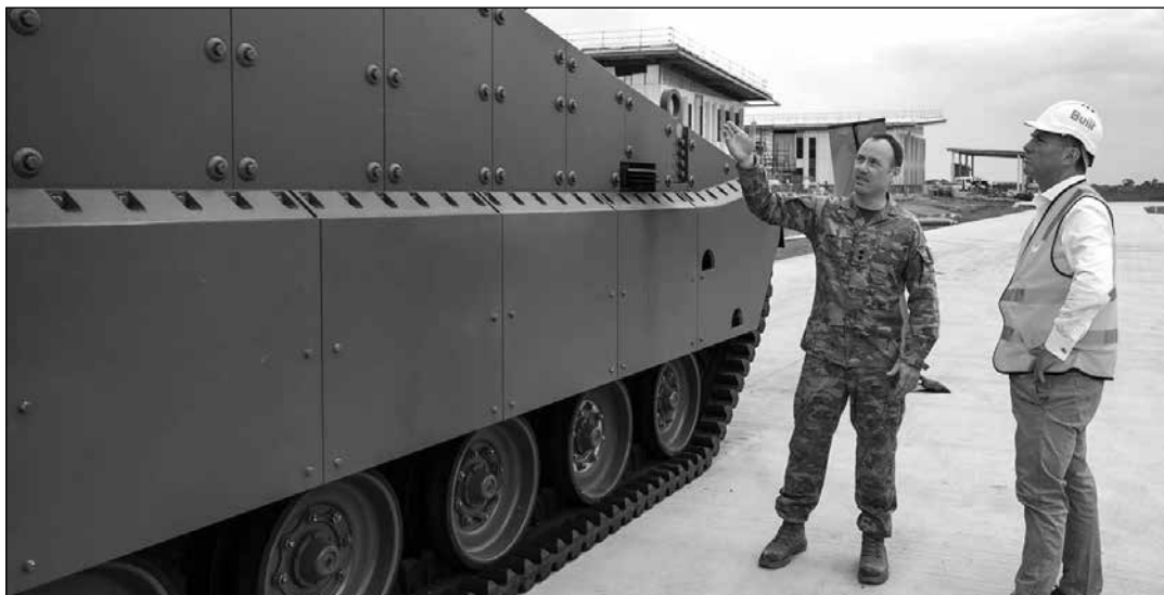
Above: Defence Minister Richard Marles inspects new fighting vehicles

They are demanding Australia prepares to fight a war with China immediately—with some US officials