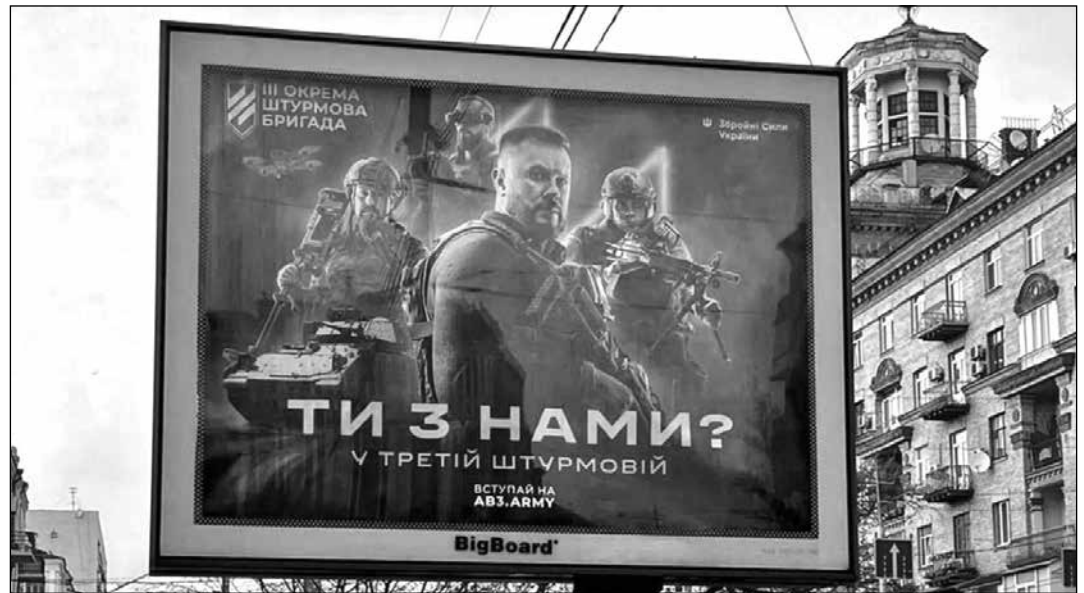
Above: An army recruitment poster in Ukraine

Ukraine has about one million soldiers, many them serving continuously for two years since the Russian invasion.