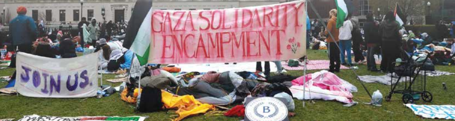
Above: The student encampment at Columbia University that sparked the movement