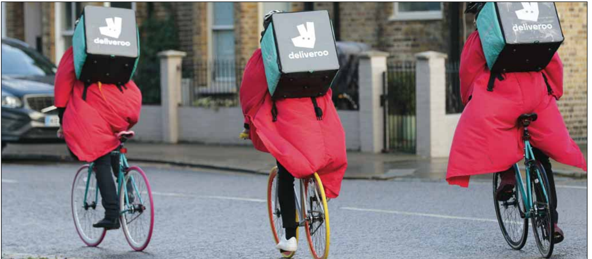
Most gig workers must pay their own insurance and cover their own sick leave, annual leave, and superannuation.