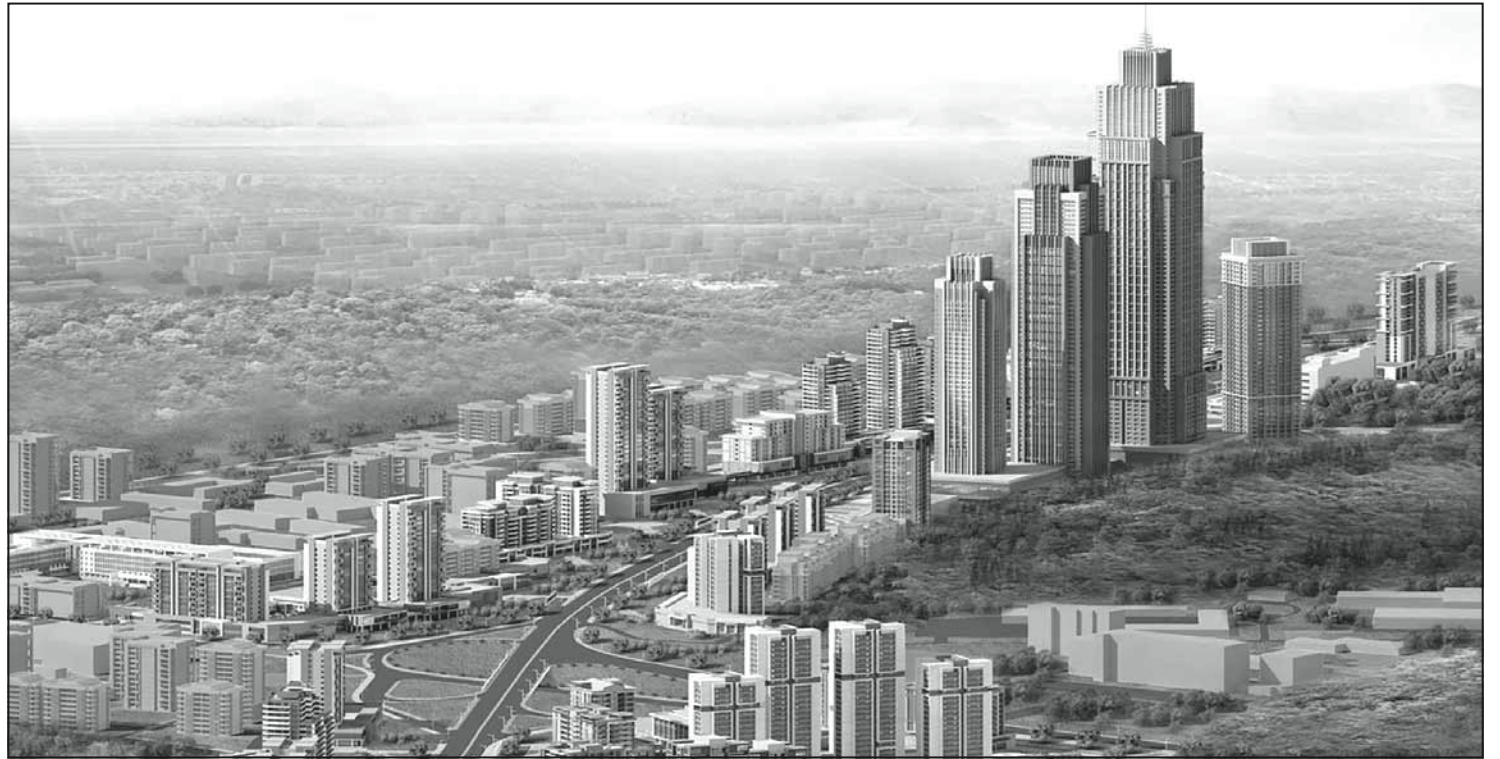
A 3D render of the Sopho street apartment project.

with the long-cherished desire of our Party for the beloved people and children and policies for the uninterrupted development of our great state social system.