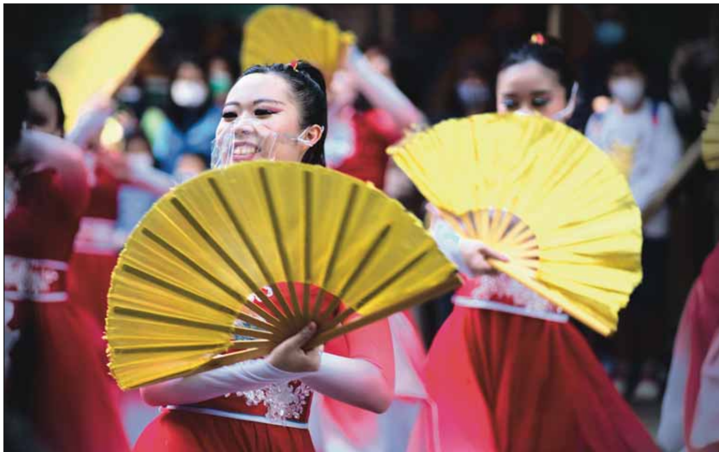
Chinese dances during a culture festival.

The next major liberation of thought took place in 1978, after Mao Zedong’s death. There was a profound ideological struggle across the country, with opponents fighting out their positions in leading newspapers. At the centre of debate was Marxist philosophy and at stake was the future of Marxism-Leninism and the Party. One side – including some in the Central Committee – promoted the “two whatevers,” as in “we will resolutely uphold whatever policy decisions Chairman Mao made, and without wavering follow whatever instructions Chairman Mao gave.” Earlier in 1978, this group held a stronger position, but we can