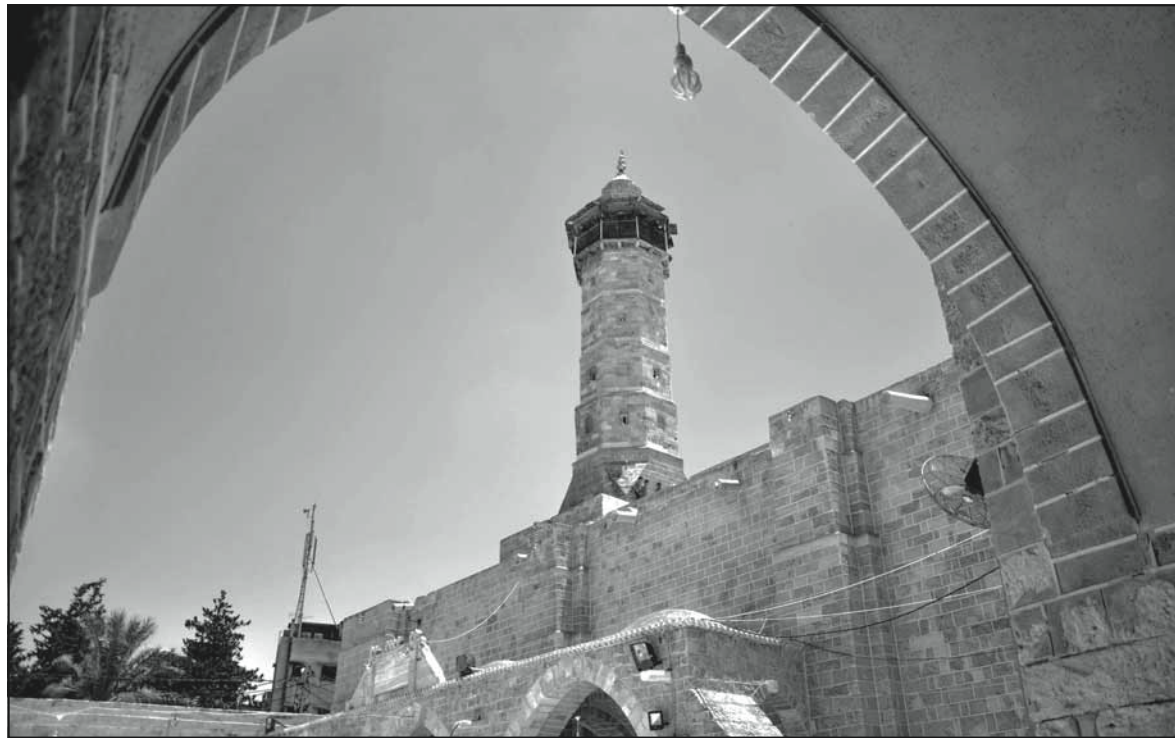
The Great Omari Mosque before its destruction.

It was destroyed in October last year by Israeli air strikes. ✪