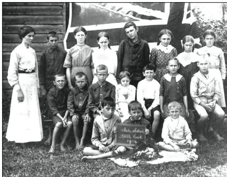
Kobble Creek State School, Queensland, 1914.

"Giving all children the start they deserve will allow them to make the most of their potential