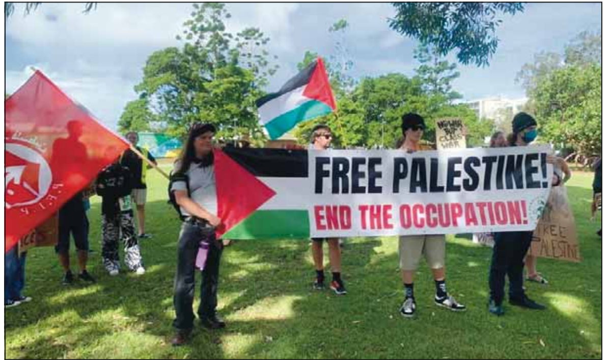
Sunshine Coast rally in support of Palestine.

Lazzarini said the agency was operating in a "hostile" environment. Since the allegations were made, an Israeli bank account belonging to UNRWA has been frozen and the agency warned that