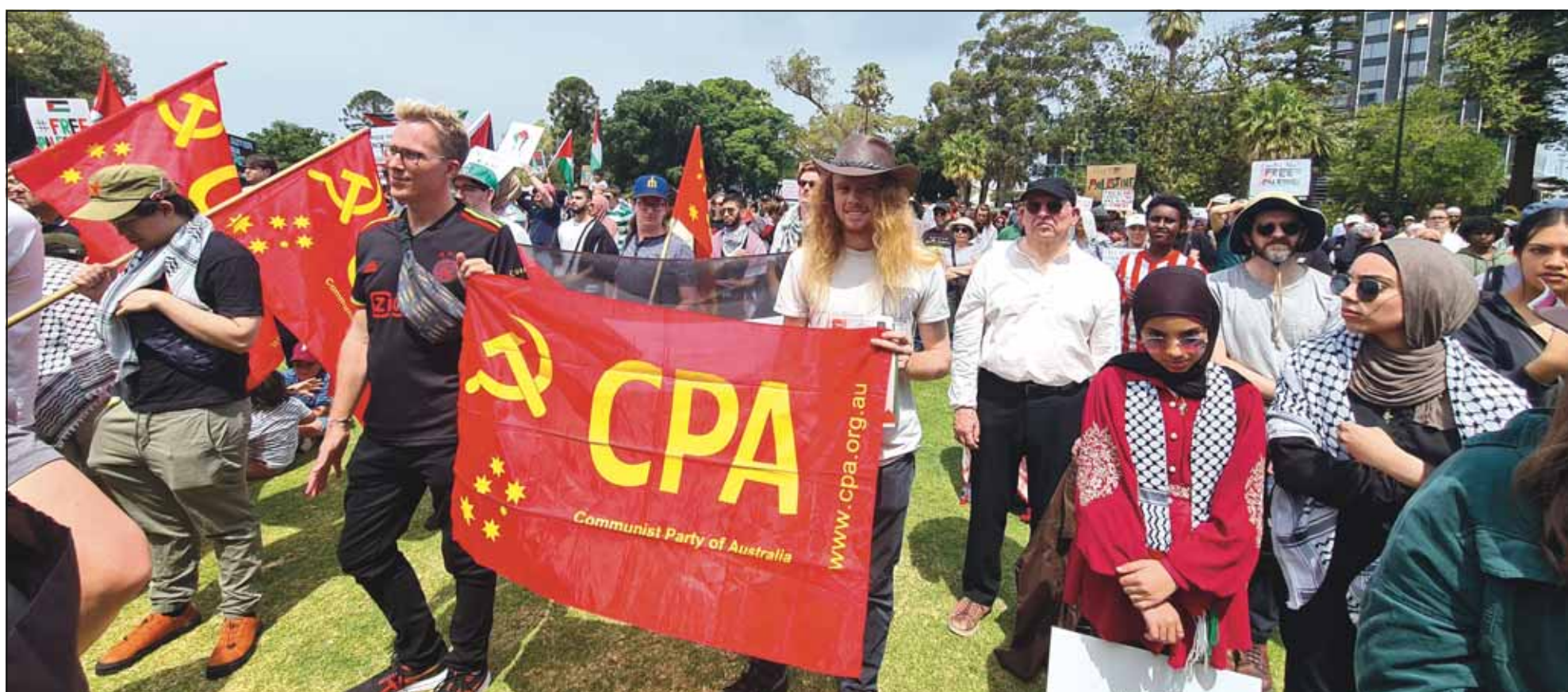
Rally for Palestine in Perth.