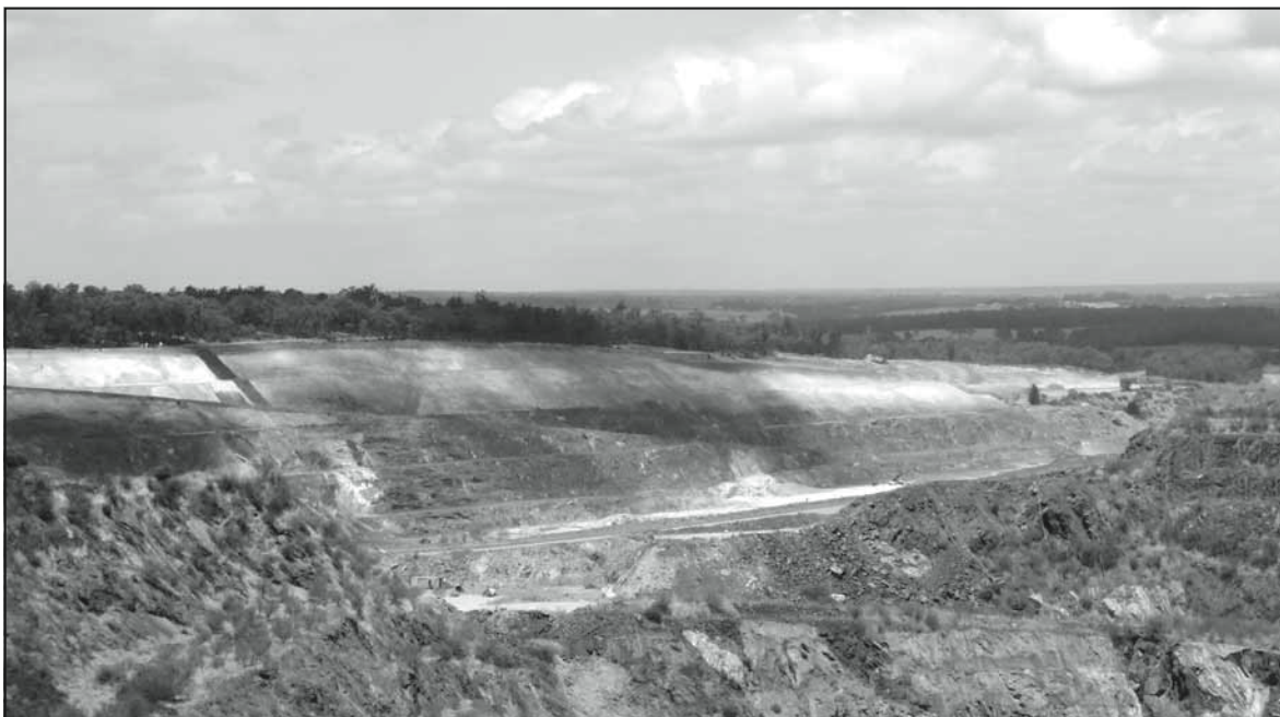
The open pit of the Greenbushes mine, Western Australia.