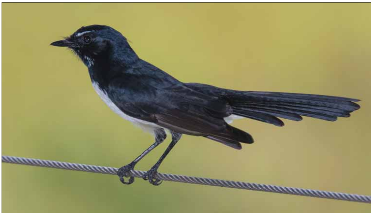
Willie Wagtail, Fogg Dam Conservation Reserve, NT.

Modern intensive farming relies on insecticides which have had a devastating impact on bird populations. Research in Germany,