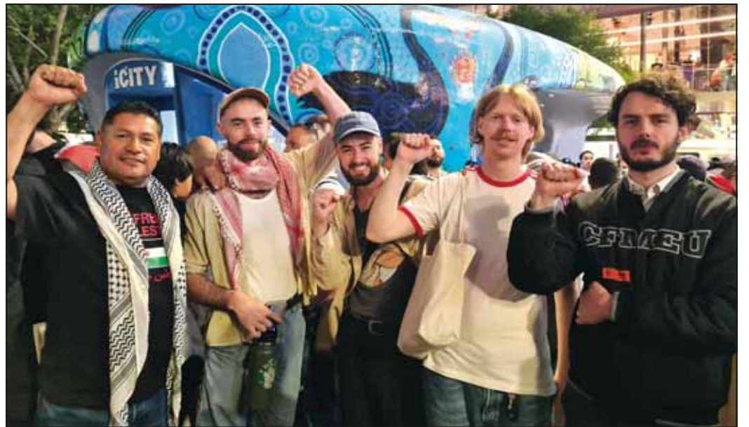
Friends of Palestine WA organised a rally on the 13th October attended by over 1000 people.

The Communist Party of Australia opposes the occupation of Palestinian land by Israel and supports the right of the Palestinian people to defend their land and people. The CPA calls on all members and supporters to attend the rallies around the country. ✪