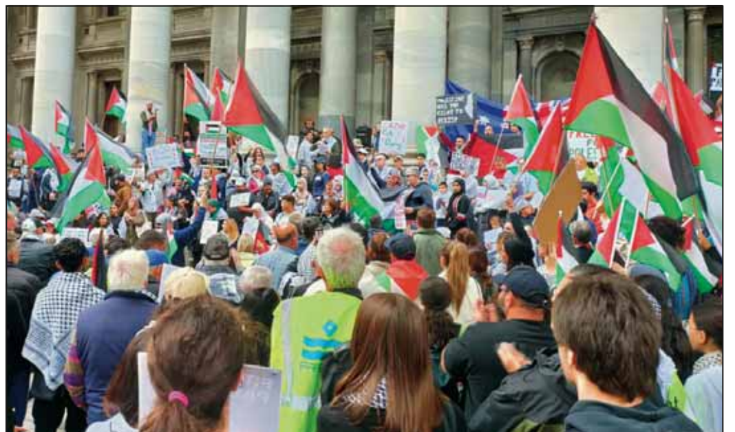
2000 - 3000 people showed solidarity for Palestine in Adelaide on 15th October.