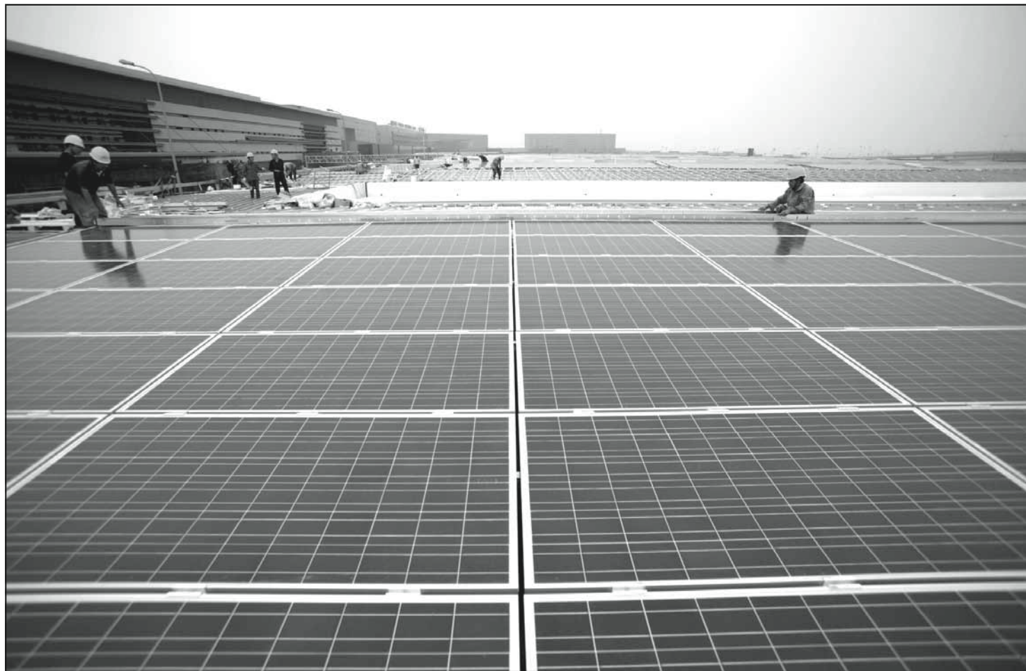
“China is now the undisputable global leader of renewable energy expansion worldwide.”