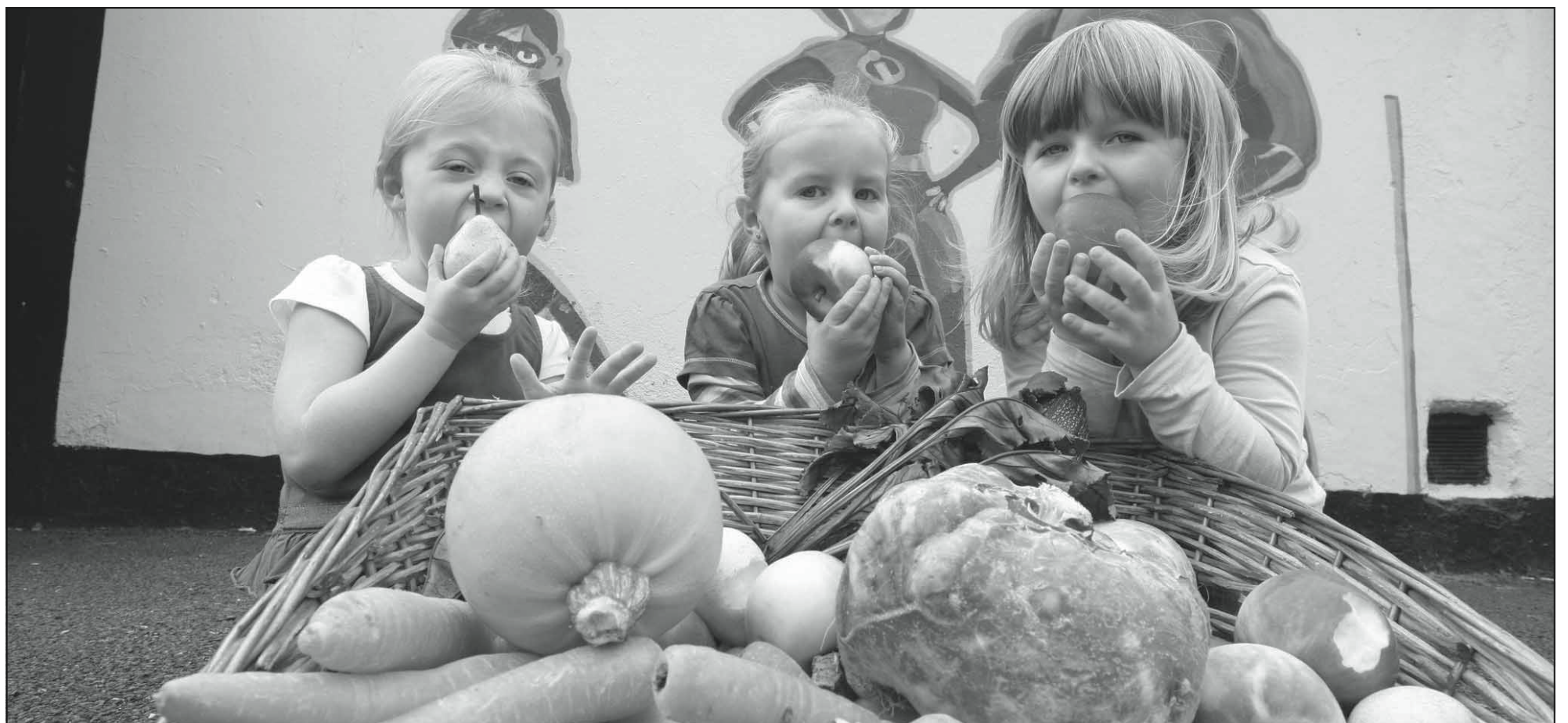
Healthy Food for All: Ireland.