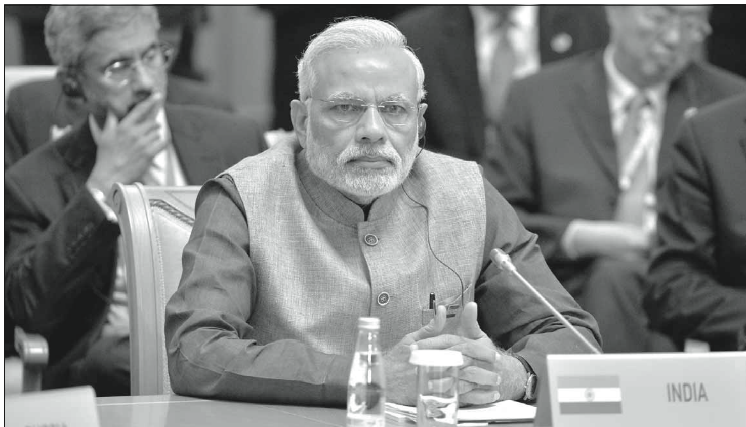
Prime Minister, Narendra Modi.

From 1st August, the linking of voter identity cards (unique and, so far, voluntary, identity number for Indian citizens)