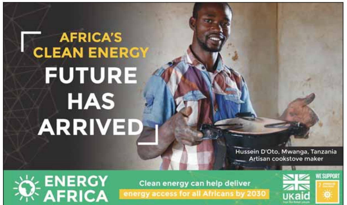
Energy Africa Infographic.

This is, again, aimed at ending the dependence of European countries on Russian natural gas. At the