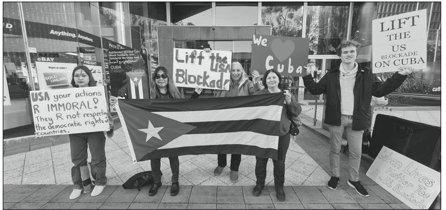
ACFS Perth rallied against the blockade, Monday 20th September 2021.

Chinese President Xi Jinping has said he's willing "to walk together with Cuba in building socialism," which should send a chill down Biden's spine. The increasing aggression of US imperialism, with its blockade of Cuba and its new cold war against China have made these ties increasingly significant and even indispensable. The murderous US sanctions have made it very difficult for Cuba to cope with the spread of the pandemic: it has its own vaccine, but not enough syringes, ventilators, oxygen, etc. So China's help is invaluable. Without it, there would be a rampant spread of the virus, encouraging discontent and a regime change that could