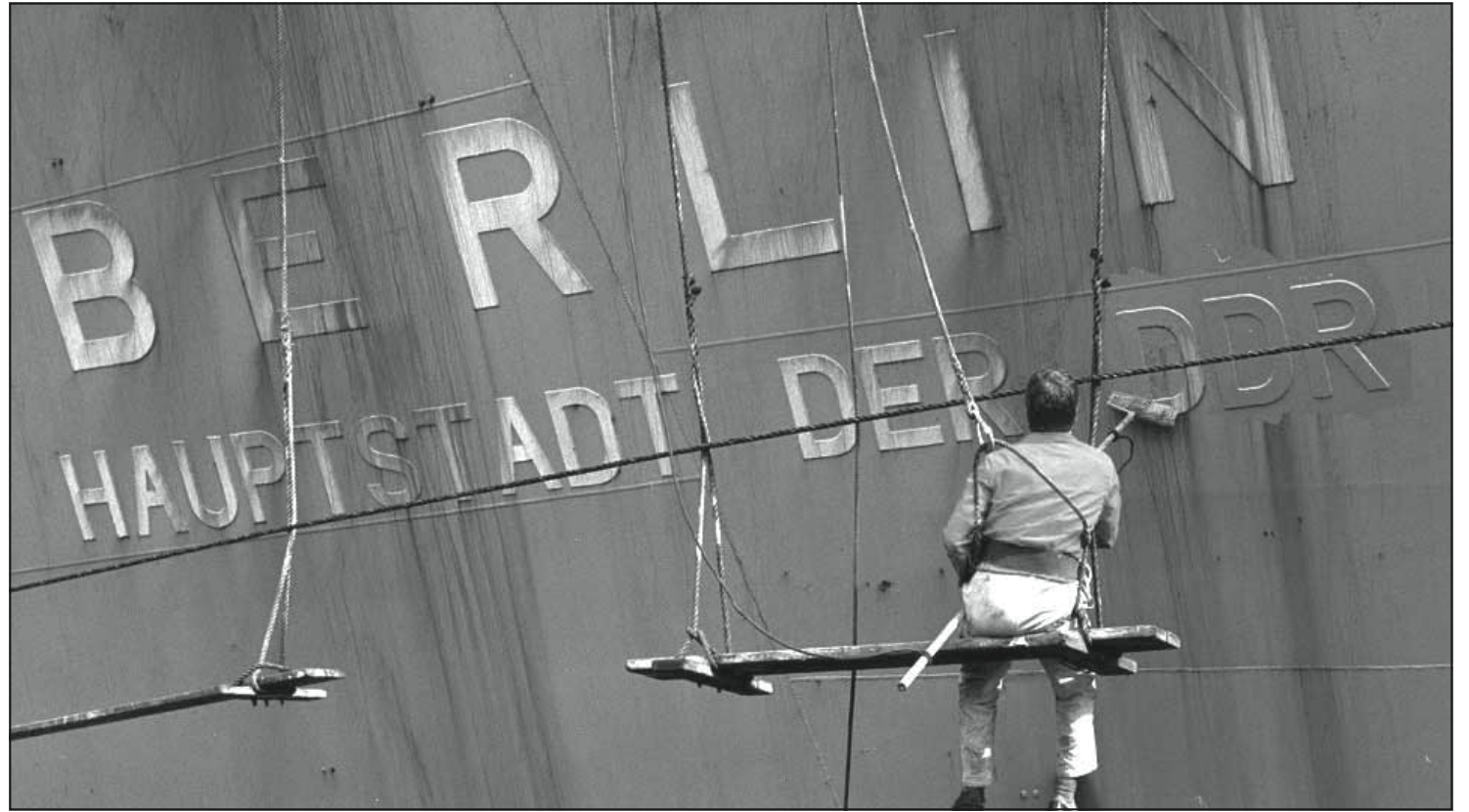
Erasing East Germany: The ship named "Berlin Capital of the DDR" has the initials of the German Democratic Republic painted over at a shipyard in Hamburg in September 1990.

Publishing companies and millions of books were confiscated. Mark Twain’s classics were among them. Public libraries were emptied, and books that people could get for tiny sums of money were trashed. Many of them, reminiscent of the days of the Nazis, were actually burned to make way for the incoming West German publishing companies. Political purges were orchestrated to remove thousands of professors and teachers