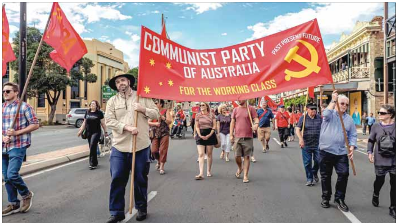
Adelaide (Photo: Fernando Gonçalves)