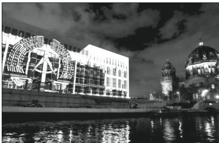
The emblem of the German Democratic Republic is projected onto the front of the “Humboldt Forum” building in Berlin, Nov. 4, 2019. The “Humboldt Forum” is the replacement building of the “Palast der Republik” (Palace of the Republic), the former East German parliament. The building on the right is the Berlin Cathedral.

When will I say mine again and mean we and ours.