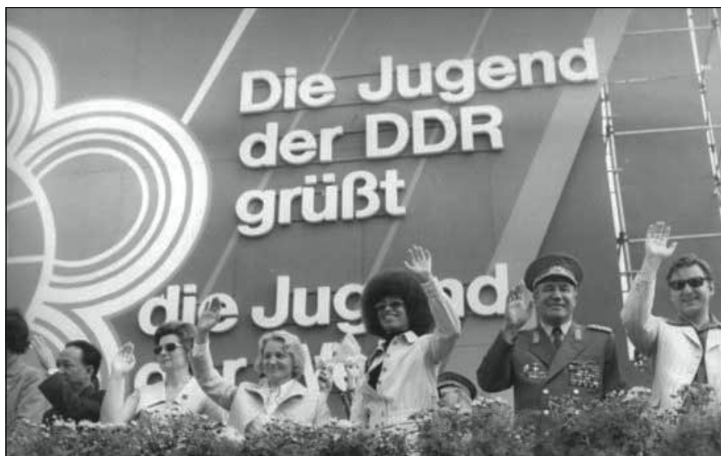
Newly-freed US political prisoner Angela Davis at the Tenth World Festival of Youth and Students in Berlin, 1973.