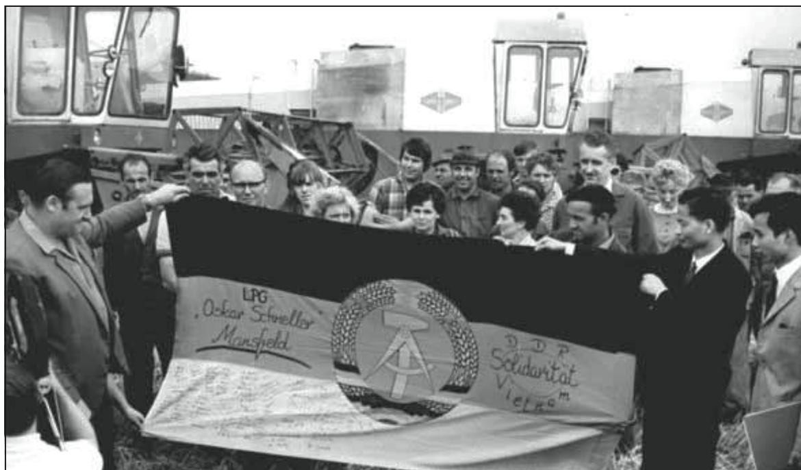
Cooperative farmers handing over a flag of solidarity with the motto ‘Solidarity Hastens Victory’ written on it to the Ambassador of the Democratic Republic of Vietnam, 1972.

fully-fledged nor perfectly formed. A socialist project inherits all the limitations of the past. It takes effort and patience to transform a country, with its rigidities and class hierarchies, into a socialist society. The GDR lasted for a mere 40 years, half the life expectancy of the average German citizen. In its aftermath, the adversaries of socialism exaggerated all its problems to eclipse its achievements.