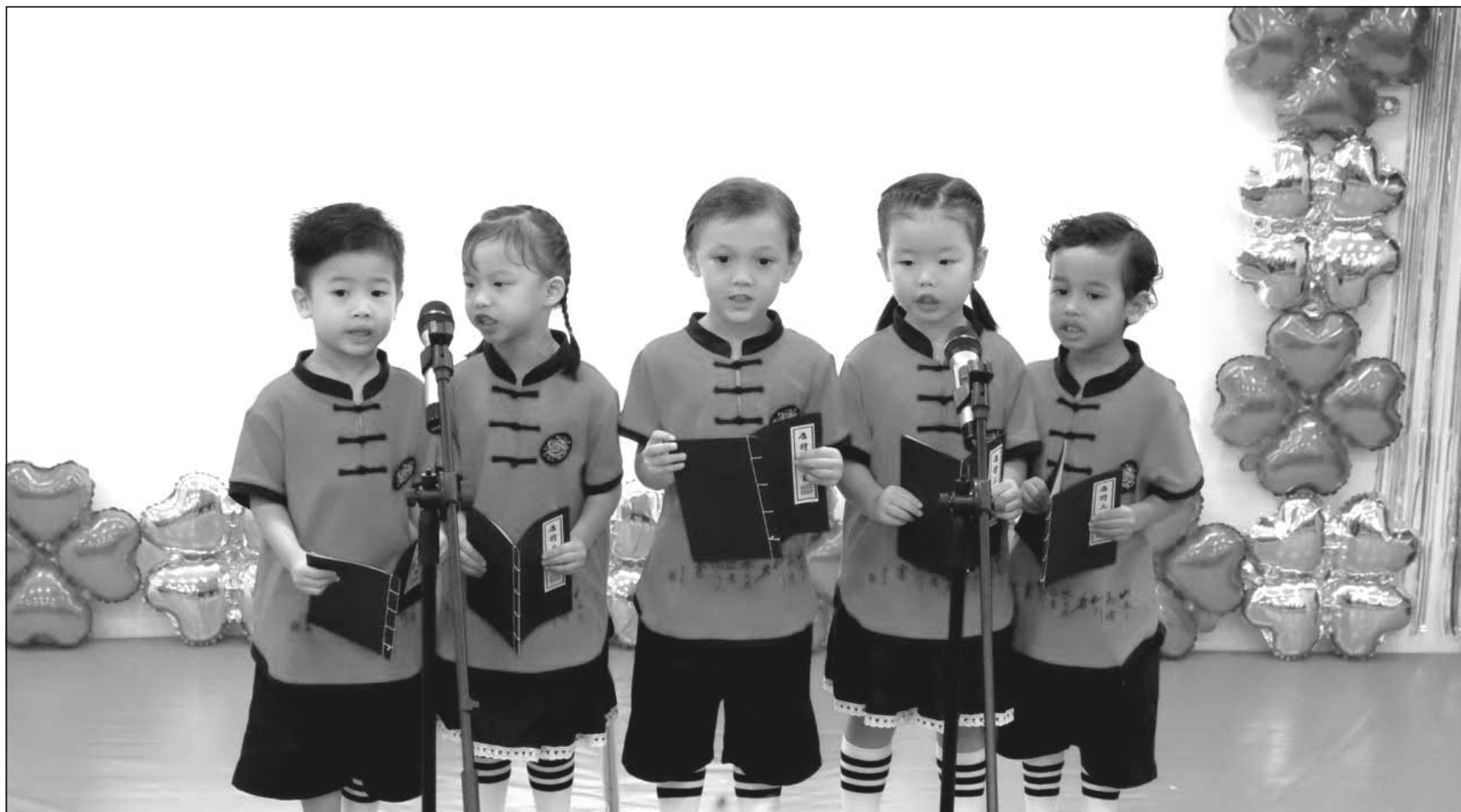
Preschoolers learn about Chinese culture and festivals. The deepening of socialism requires ongoing reforms to bring forth the creative powers of the people.

“social imperialism” emerges, that Lenin’s words “socialists in words and imperialists in deeds,” are distorted.