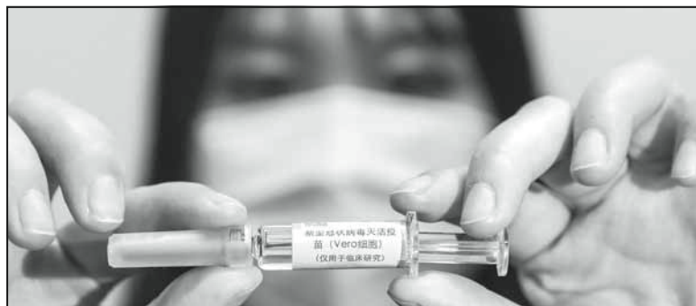
A potential Covid-19 vaccine at a production plant of SinoPharm in Beijing.

On Twitter, Fischer also said it's "important to stay true to facts if building up trust, calling to stop