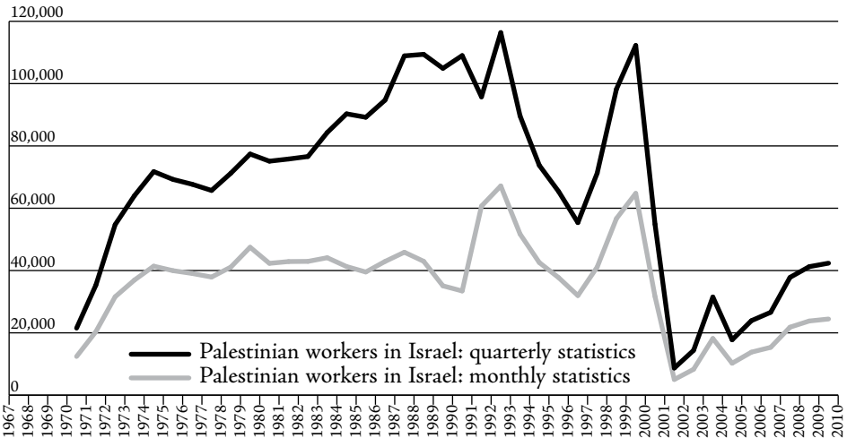
GRAPH 1: PALESTINIAN WORKERS IN ISRAEL

which NIS 1.1 billion was transferred for the realization of workers’ rights. The response of the Ministry of Finance (Minister of Finance, 2009) is not detailed, does not include adjustments for the consumer price index and interest, and does not fit the data we found.