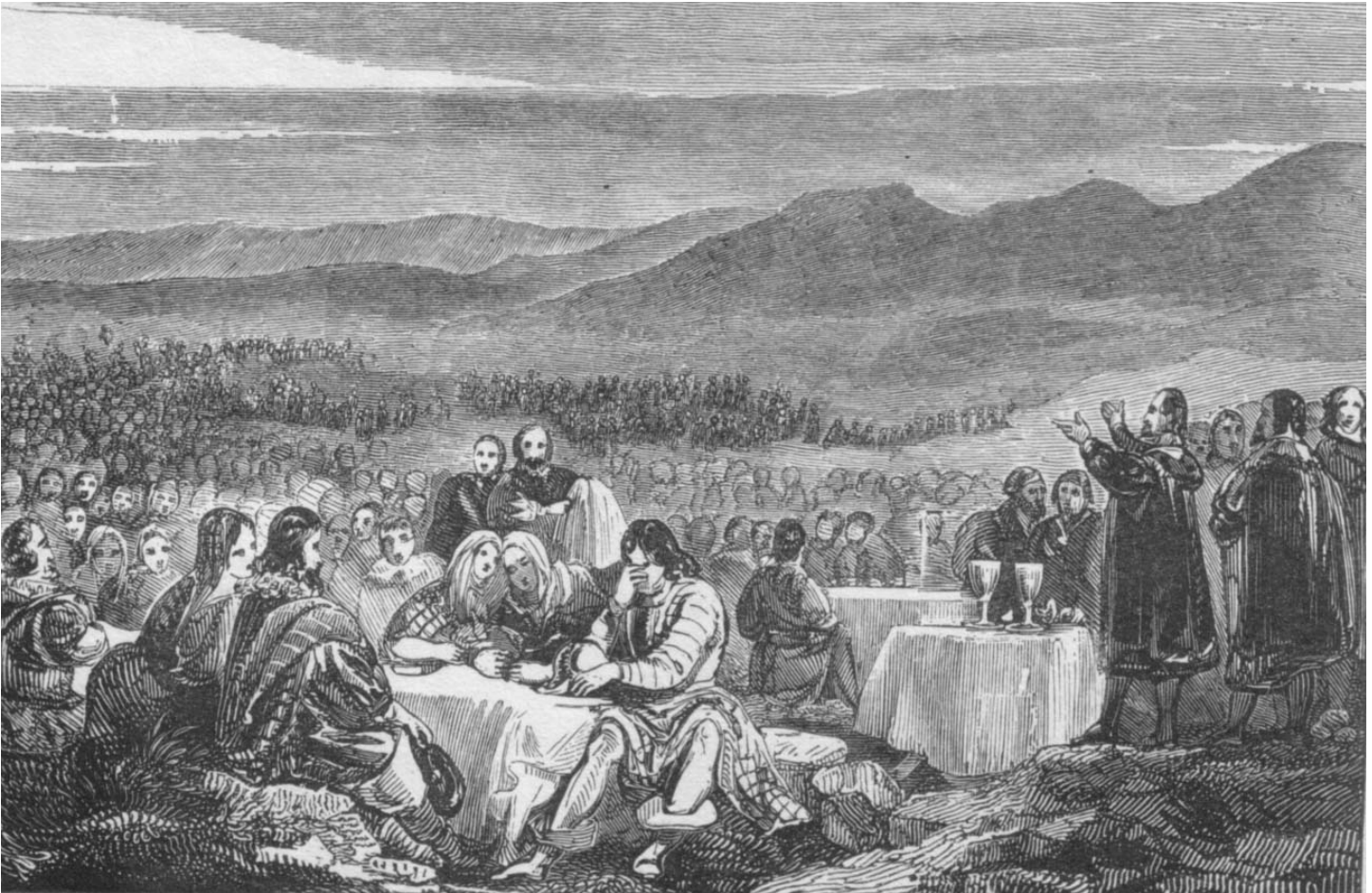
Administration of the Lord's Supper in the Fields