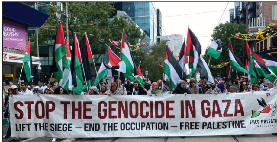
Australian people in their thousands demonstrate in solidarity with the Palestinian people

Palestinians are showing that peoples of the world have the right, and duty, to resist oppression,