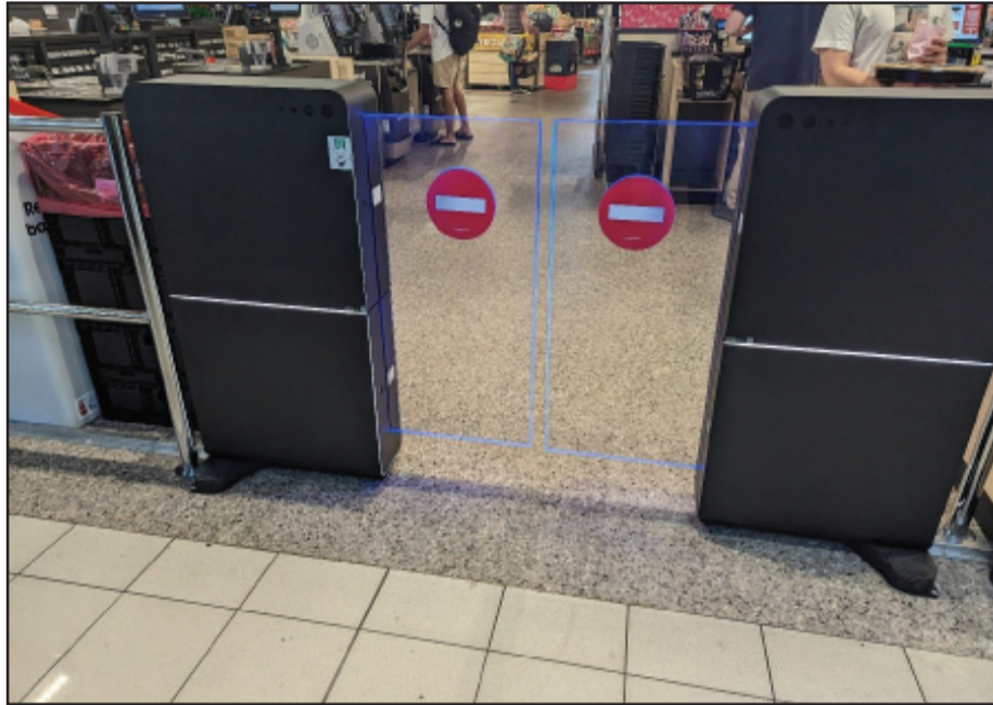
Supermarket “smart gate” locks in shoppers until checkout releases them

introduction of so called: smart gates, of anti-theft fog and security databases, such measures such as the expansion of security teams and of the trolley-lock system only harm those within working-class suburbs.