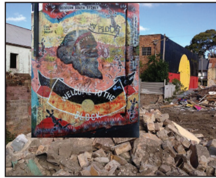
Collage of demolition of Redfern's Block, which began in 2011. All of the original buildings including the flag mural have been removed.

The Embassy won 62 affordable housing apartments for First Peoples including families, at 80 per cent of