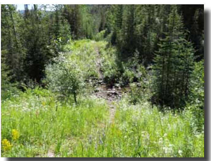
The last three miles of Bunker Creek Road 549 was decommissioned under Clinton's 1998 Clean Water Action Plan. Here a bridge was removed at Warrior Creek.

the watersheds before deciding which roads better to maintain and which roads to decommission. We also reminded the Flathead it must either remove or monitor annually all culverts left in closed roads in these bull trout watersheds. Jim Creek is also an "impaired" Water Quality Limited Stream due to roads and sediment.