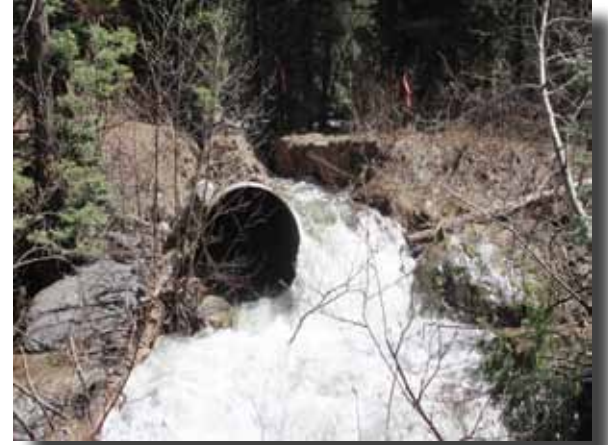
Flathead NF photo of a 4' plugged culvert putting the Emery Creek Road into trout habitat!

aimed at removing ESA protection from the NCDE grizzly bear population and habitat! its Roads to Ruin documents the need to continue an aggressive, integrated road decommissioning program on the Flathead to reduce the road system to a manageable size and in order to protect water quality, fish and wildlife.