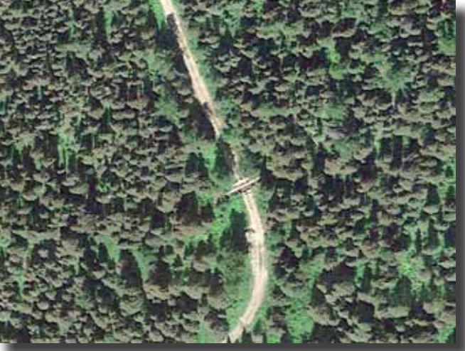
Google Earth image of Emery Creek culvert washout!

We thank you all on page 7 for helping us meet our budget last year and ask for your continued support of our work. We need to stick together to protect habitats for fish, wildlife and people!