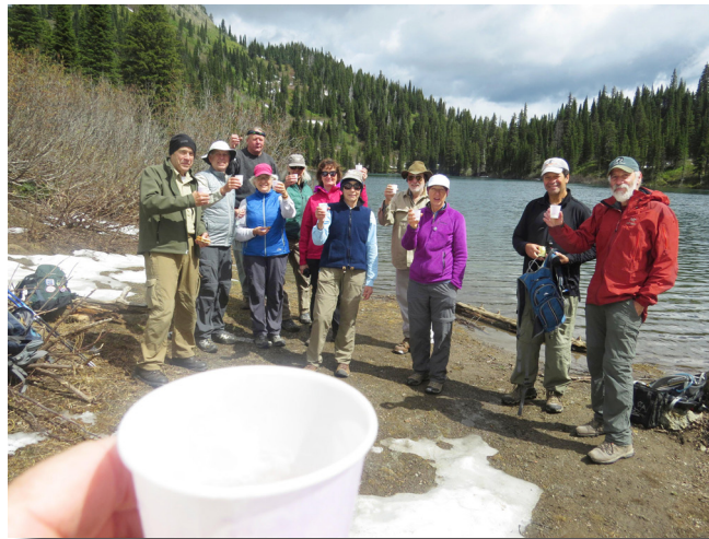
Swan Rangers toasted their 601st outing June 10th!