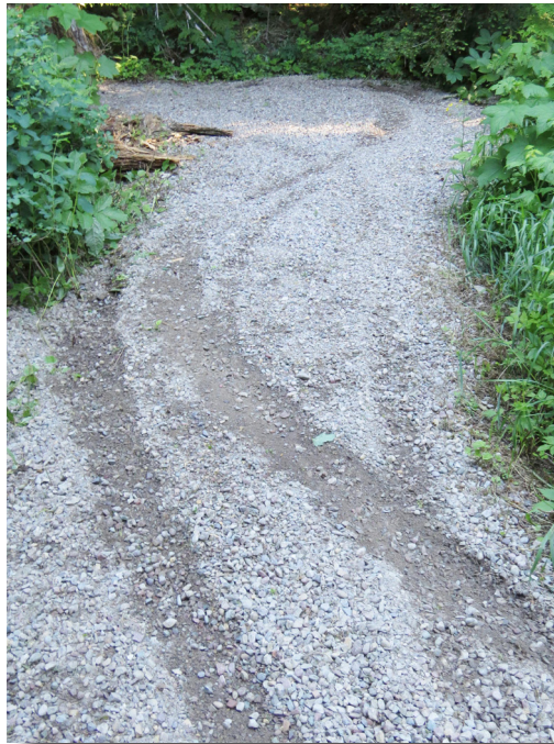
Illegal motorcycle damage to the wheelchair accessible Krause Basin Nature Trail!

We sent the District photos showing how root rot naturally thins Douglas fir that crowd in on sun-loving Ponderosa pine - with no need for logging or the roads that result in more weeds and more ATV problems. We don't intend to let up!