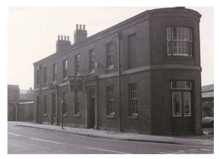
Brunswick Inn, Railway Terrace

Though part of Midland Road has been redeveloped in this century, the area retains the major buildings of the Victorian Railway era.