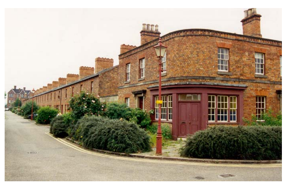
Railway Conservation Area

Prior to 1838, Derby had developed little beyond the branch of the Derby Canal, an arm of which terminated just beyond Park Street. Traces of it can still be seen in the area. The site of the present station was then parkland but discussions were already taking place between