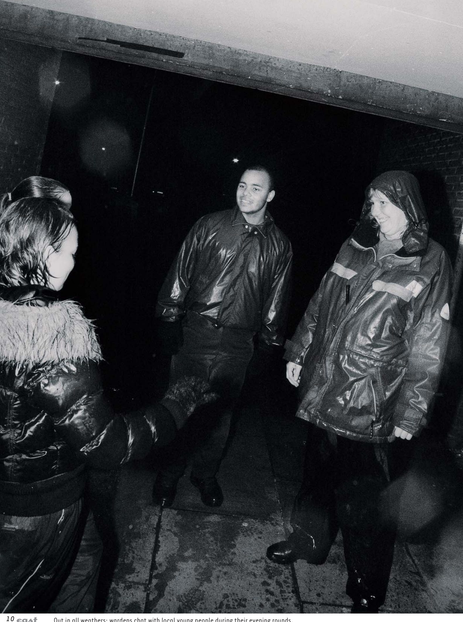
10 east Out in all weathers: wardens chat with local young people during their evening rounds.