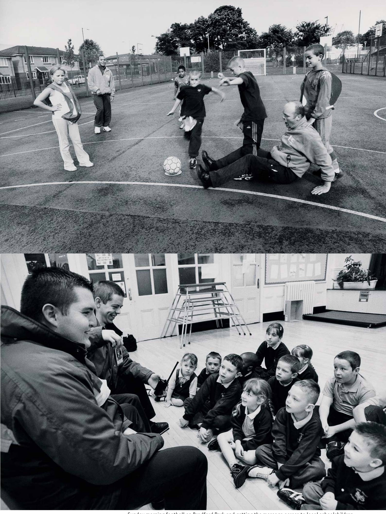
Sunday morning football on Bradford Park and getting the message across to local schoolchildren.