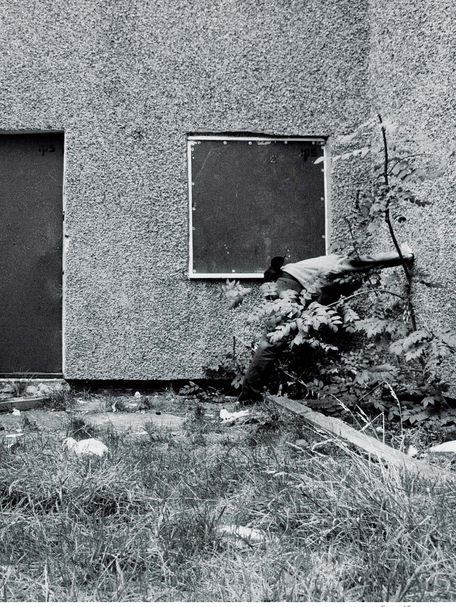
Eyes and Ears