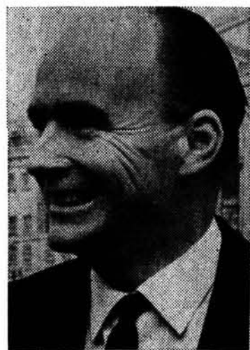
Where Stands Ireland?

The junta has set the "Sixteenth Congress" of the GCLG for 29th March. The main purpose of the "congress" is to legalise the position of the appointed fascist officials. Various trade union federations have already come out both against the March date and the way the meeting is being convened, since no workers or employees have been consulted.