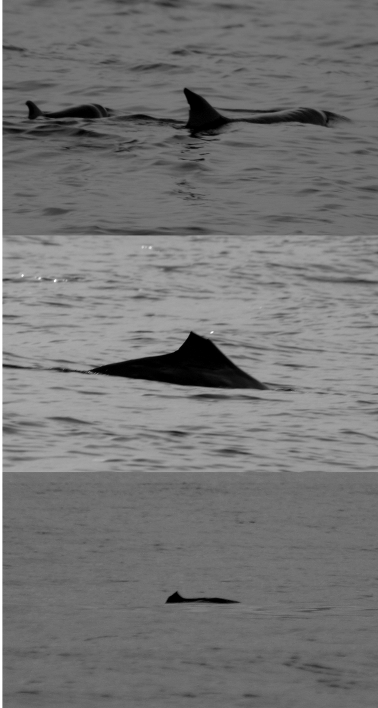
FIGURE 2. Dwarf sperm whales with distinctive dorsal fins ( top, middle ; top right individual with notch in middle of fin), photographed off the island of Hawai'i, 9 October 2003, and possible resighting ( bottom ) of one individual, photographed 20 October 2003.