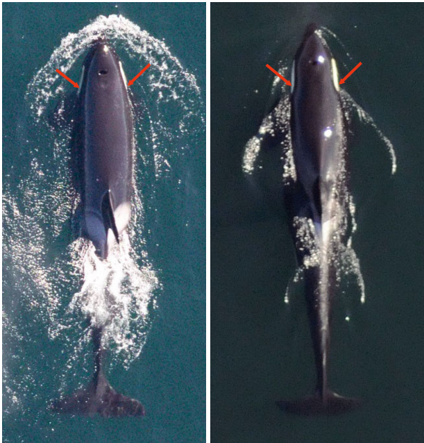
Fig. 1. K13, a robust 41.5 yr old female Orcinus orca (left) and L67, an emaciated 23.5 yr old female that subsequently died (right). Arrows show where head width (HW) measurement was taken at 15% of the distance between the blowhole and anterior insertion of the dorsal fin (BHDF). Note that the white eye patches of K13 angle outward towards the posterior, while the eye patches of L67 angle inward and follow the shape of the skull