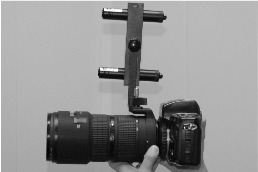
Figure 1. Two laser-pointers mounted in parallel within a lightweight plastic housing attached to the adjustable tripod-mount of a Nikon 80–200-mm zoom lens.

As an example of the utility of this setup, we measured the heights of killer whale dorsal fins during routine photographic identification surveys of whales in Puget Sound, Washington State. The photographed whales were members of the “southern resident” population that has been monitored through photo-identification techniques since the early 1970s (Bigg 1982). Consequently, each member of this population can be photographically identified and coupled with known life-history data, including both sex and age (Bigg et al. 1987, Olesiuk et al. 1990). Killer whale dorsal fins are a prominent secondary sexual characteristic. The fins of subadult males “sprout” and begin to exceed the height of adult female dorsal fins as they approach physical maturity (Olesiuk et al. 1990). As such, dorsal fin height provides a useful measure of both sexual dimorphism and sexual maturity.