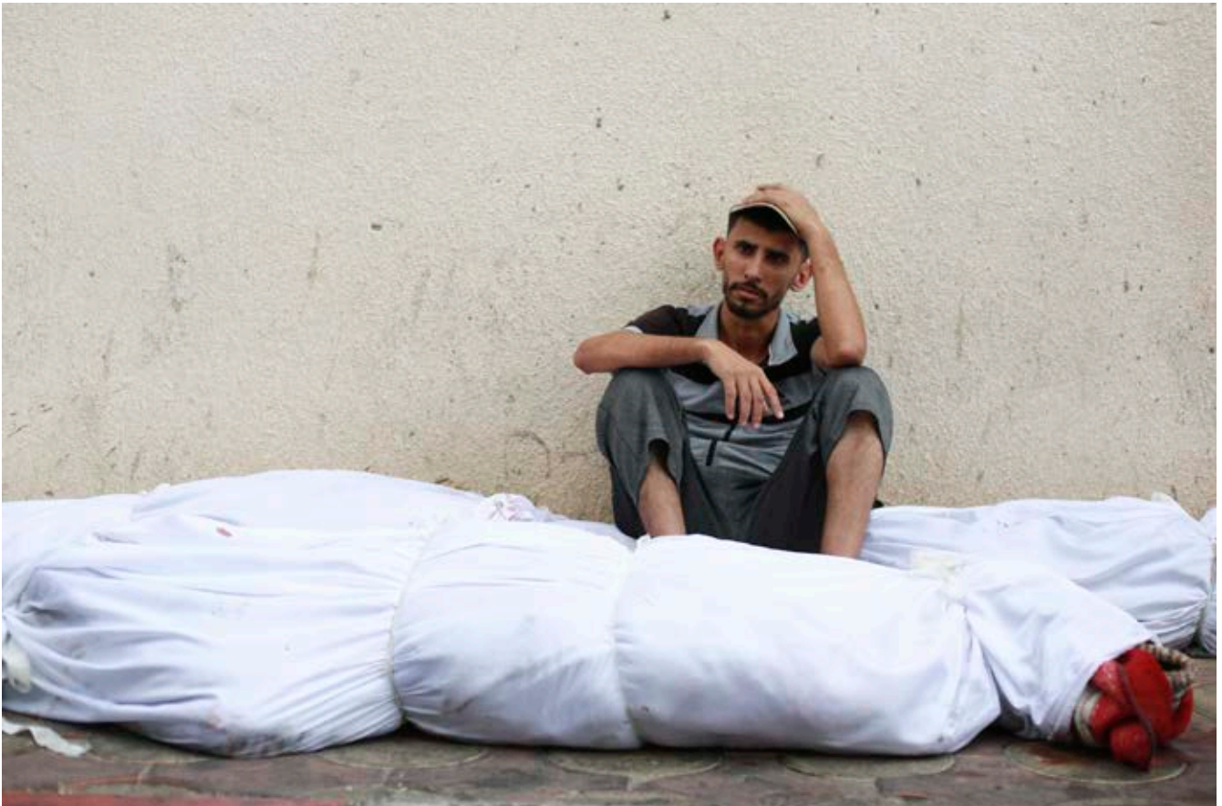
A Palestinian man with family members killed by Israeli bombing in Jabalia, north Gaza, 9 October

tors, including 46 children, and injuring of 36,000 in the peaceful March of Return of 2018-19. Settlers from neaSderot ate popcorn and cheered Israeli snipers as they mowed down defenceless people like nine pins.