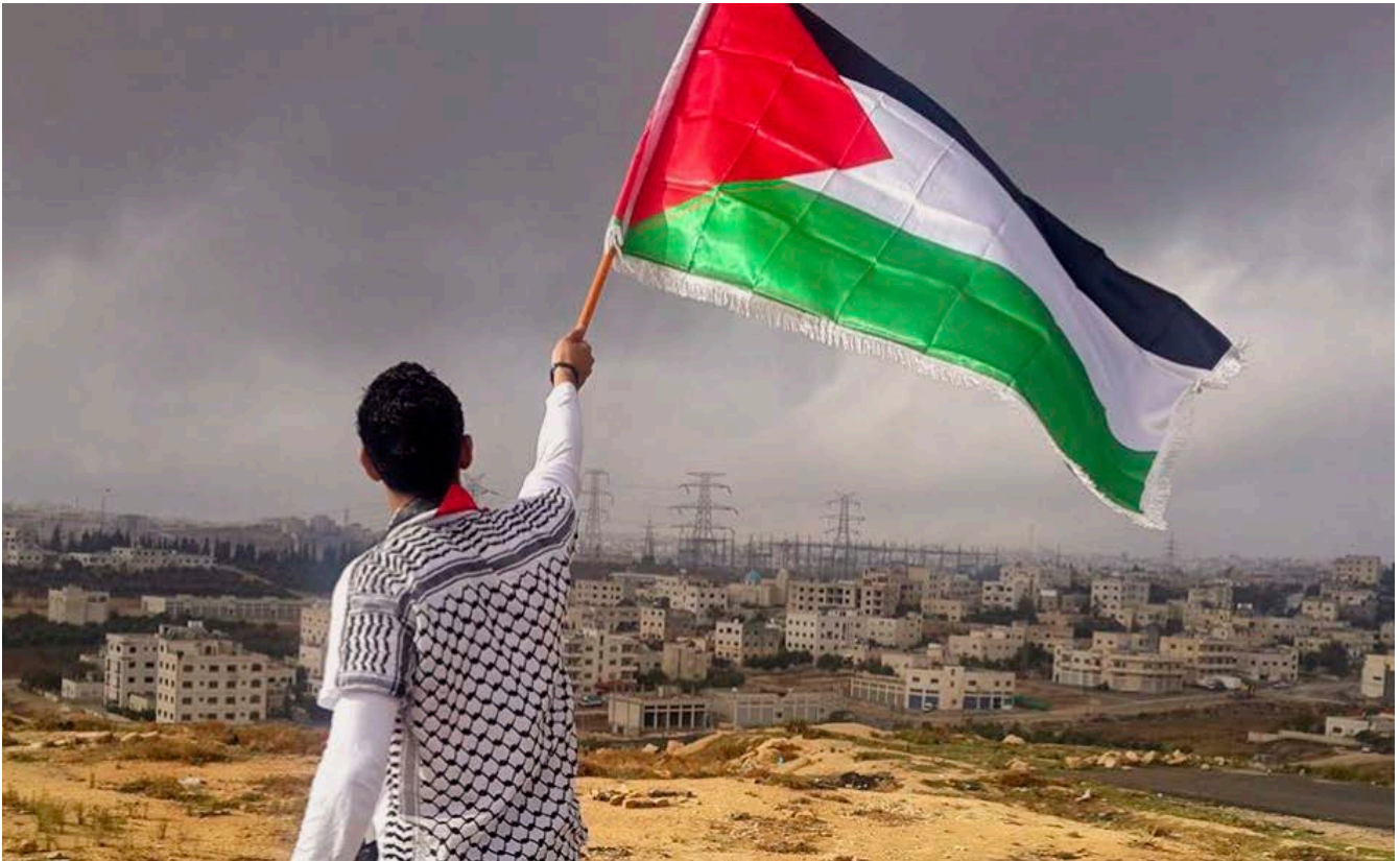
Palestinians have shown that they can never be vanquished – Palestine will be free!