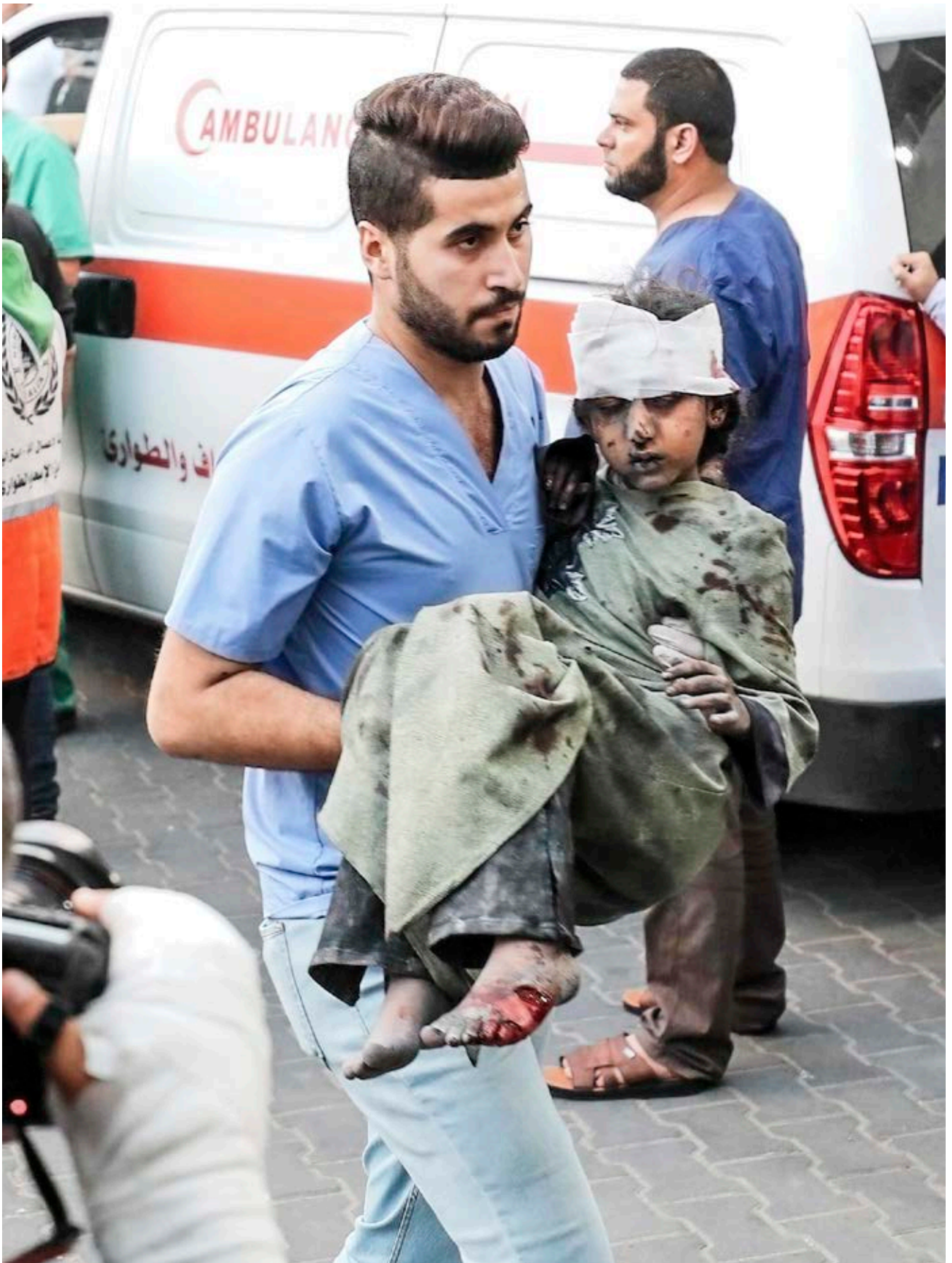
A paramedic rushes a wounded Palestinian child to casualty at Al-Shifa Hospital, Gaza City. By the end of October, some 5000 children had been killed in Gaza and many thousands more injured.