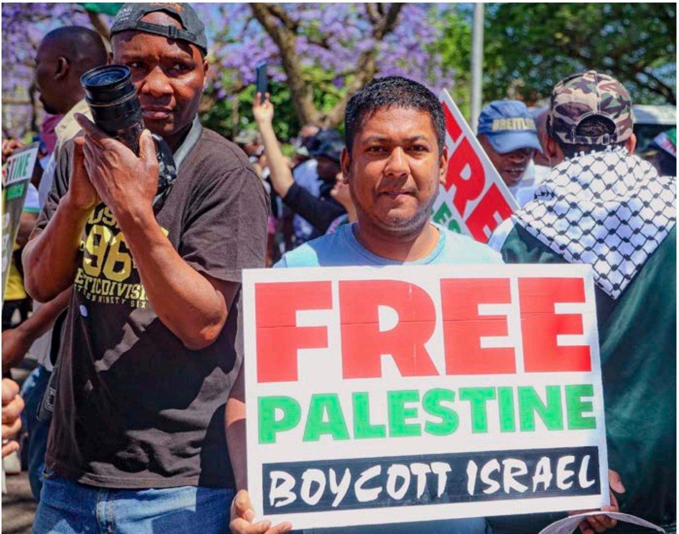
Solidarity must be concrete – the message at one of the many protests in South Africa against the war on Palestine

tinue your solidarity as our situation gets more difficult, continue to protest, demonstrate, pray, and join your hearts with ours. And ensure that your ANC government too continues to support our struggle and champions our cause in the UN and other multilateral bodies.”