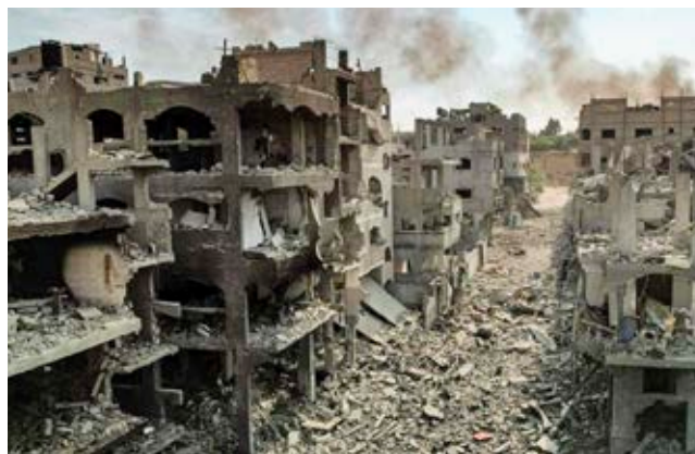
Gaza City, 10 October

The Collective West and its servile media claimed 7 October was an “unprovoked” attack. No reference was made to more than 75 years of provocation of ethnic cleansing, incremental genocide and collective punishment; or the 17 years of Gaza’s siege; or the five deadly onslaughts on Gaza since 2008; or the cold-blooded assassination of 220 protes-