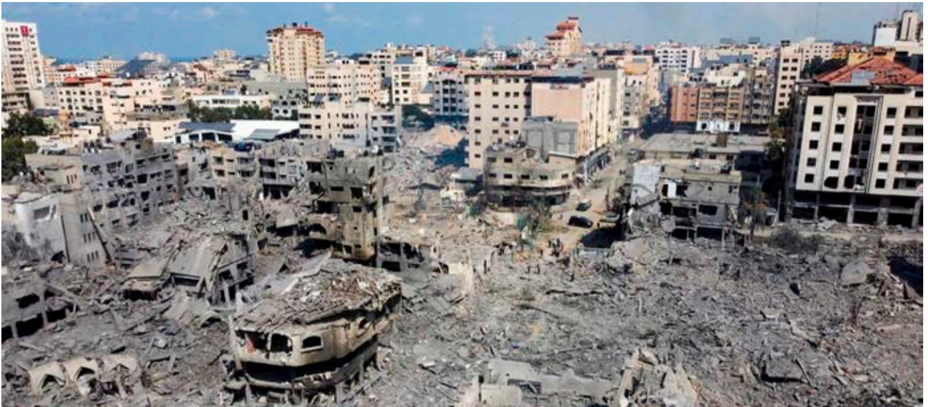
Tens of thousands of homes have been destroyed across Gaza, and the bombing continues

In the following statement, the Congress of South African Trade Unions pledges its unwavering solidarity with the Palestinian people in their quest for justice, peace and for the end of violence