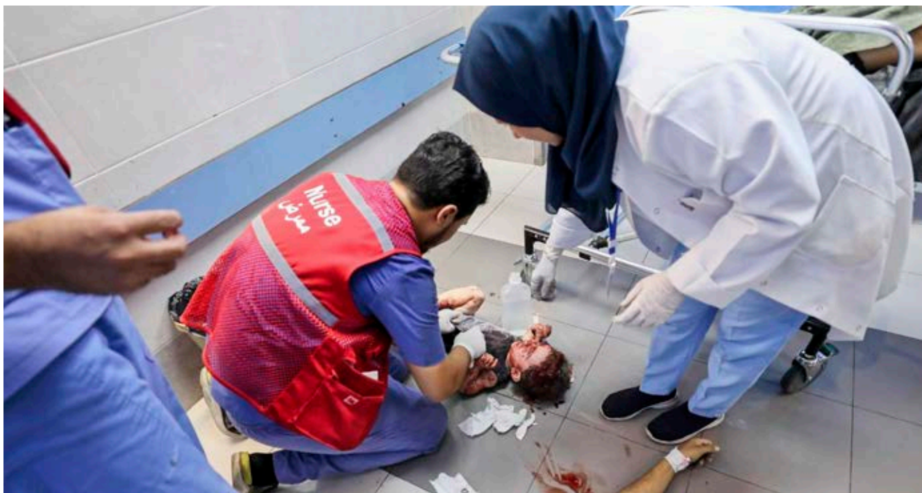
A wounded Palestinian child receiving treatment at the overcrowded Al-Shifa hospital following an Israeli attack, 11 October

Righteous people mourn the loss of life of all civilians that died, Jews and Palestinians, yet the losses on both sides are incomparable. Palestinians have been punished for decades, had no hand in the Nazi Holocaust, lost their land to a criminal colonial project, and are the ones suffering unspeakable brutality. As has been observed throughout history, when slaves rise up against the slave owner, and deal with him and his family, the blame is not on those who had been the victims of oppression. They hold the moral high ground. Their cause is just. Nevertheless, it seems the situation could not look bleaker for Gaza, and for that matter all Palestinians. Or could there be a twist in the tale? ★