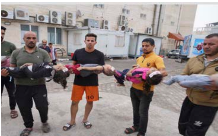
Devastating heartbreak – the scene outside Al-Aqsa Martyrs Hospital, central Gaza, 29 October

The SACP calls upon the world working-class movement and progressive forces in every country to intensify mass demonstrations against the atrocious apartheid Israeli settler state and its genocidal deeds. In our country, we will press ahead with democratic protest action among others for the apartheid Israeli settler state embassy to shut down and leave. We call upon our trade union movement to intensify the Boycott, Divestment and Sanctions activities against the apartheid Israeli regime. ★