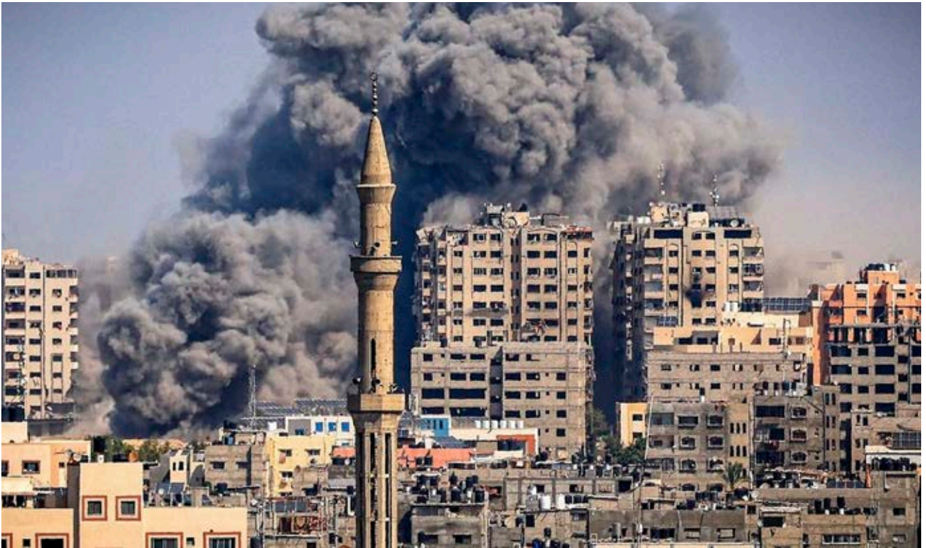
Israeli air strikes on Gaza City, 12 October