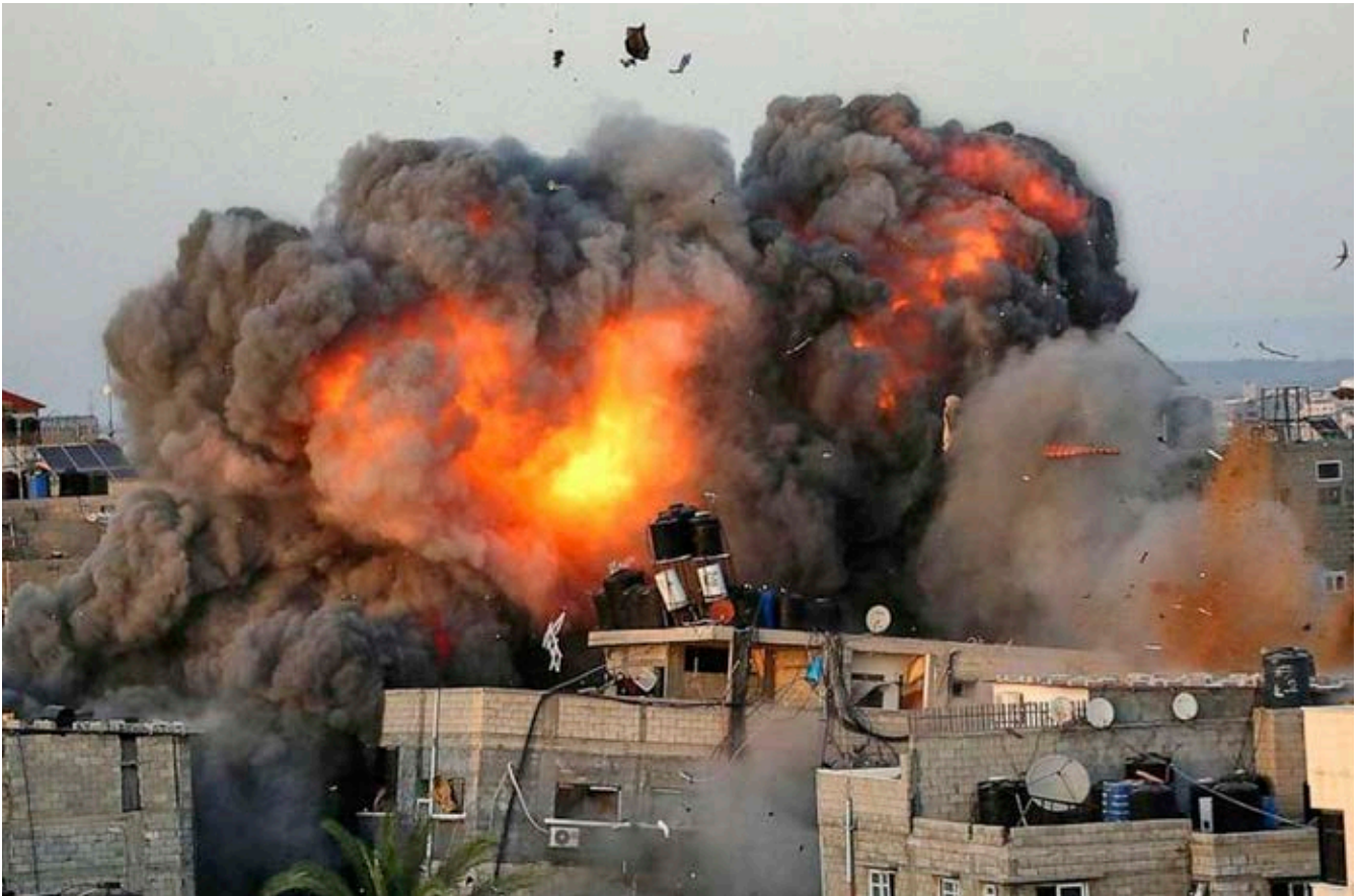
Not Gaza, but the West Bank: Israel's aggression against the Palestinian territory has a long history, but now millions of civilian lives are at stake

their rights, their land, their heritage in pursuit of it illegitimate colonial annexationist agenda and domination schemes.