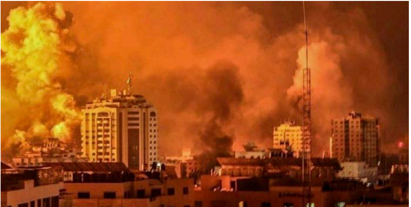
The bombardment of densely populated Gaza is a war crime on an industrial scale