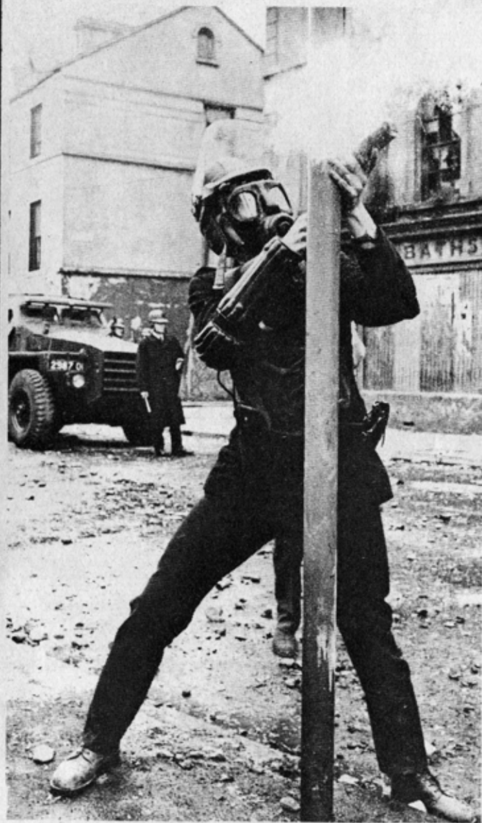
● When the gagging stops, the gassing begins.

Did we hear somebody talking about perfidious Albion?