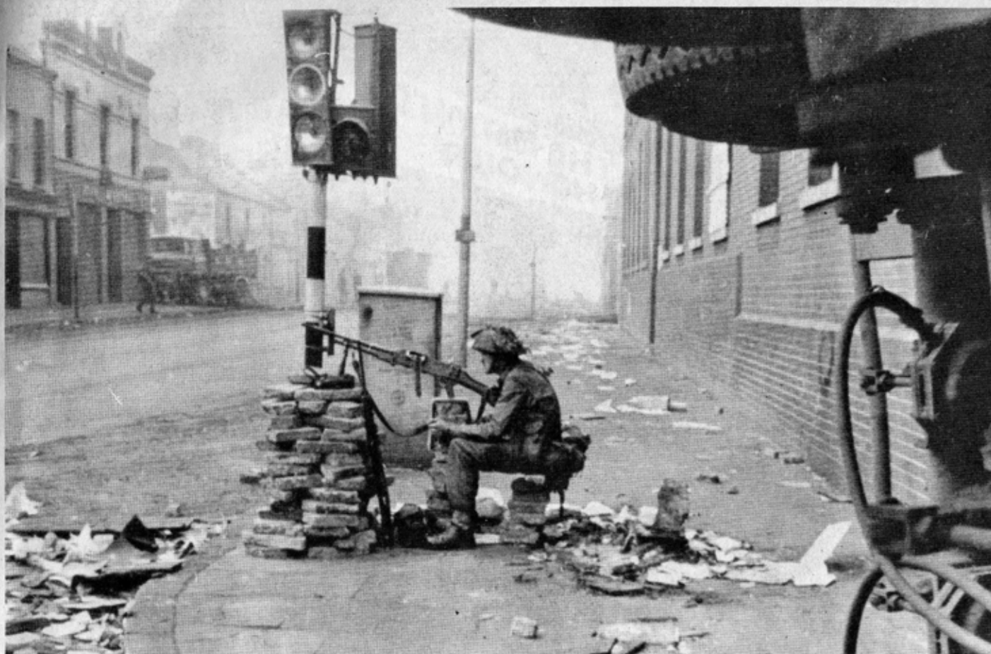
● When British law collapses, British troops move in . . . Belfast, 7.25 p.m., August 16.

Caradon rejected Hillery's claim of 26 County jurisdiction in the North by offering the Lemass/Lynch-O'Neill tea parties at Stormont as proof that the Dublin Government had recognised "the constitution of Northern Ireland". Terence O'Neill had stated this on numerous occasions but both Lemass and Lynch denied that any such thing was implied. This Fianna Fail policy of 'hands across the border' had certainly rebounded, with a vengeance.