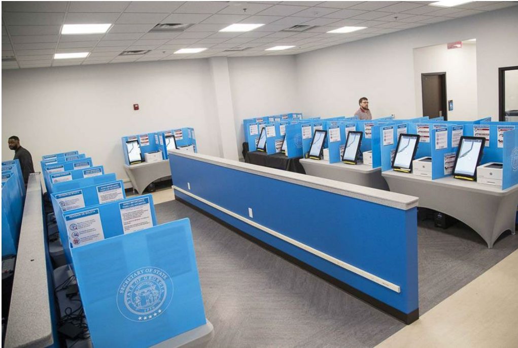
Figure 4. Gwinnett Elections Office Polling Place

385. Figure 4 is a true and correct photograph of the inside of the Gwinnett Elections Office polling place in Gwinnett County, Georgia, taken in early voting in the March 2020, Presidential Primary.