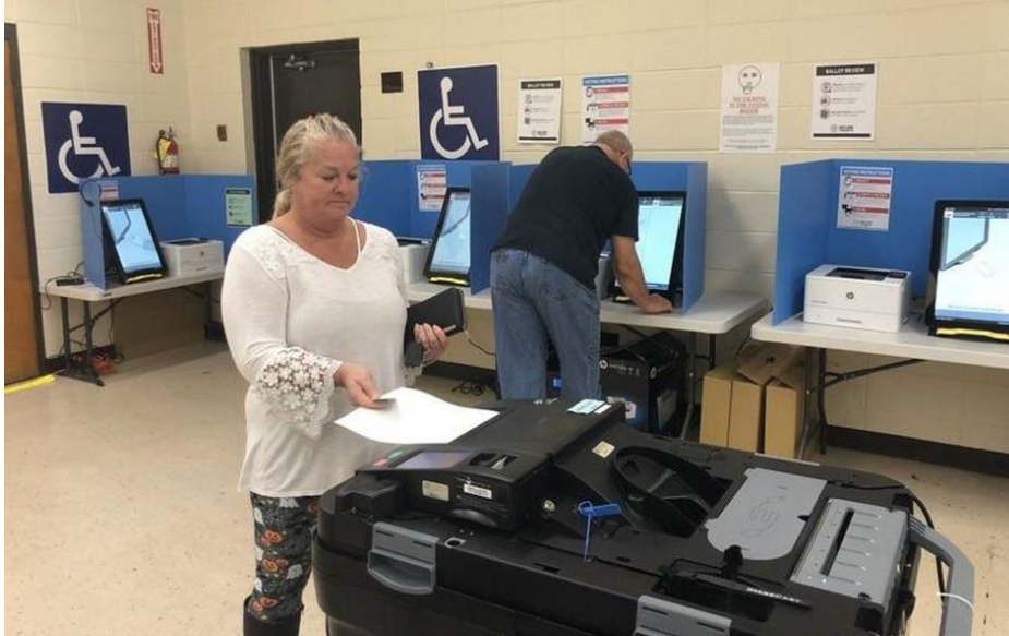
Figure 5. Cartersville, Georgia Polling Place

387. Figure 6 is a true and correct photograph of the inside of the State Farm Arena polling place in Fulton County, Georgia, taken in October 2020, during early voting for the General Election.