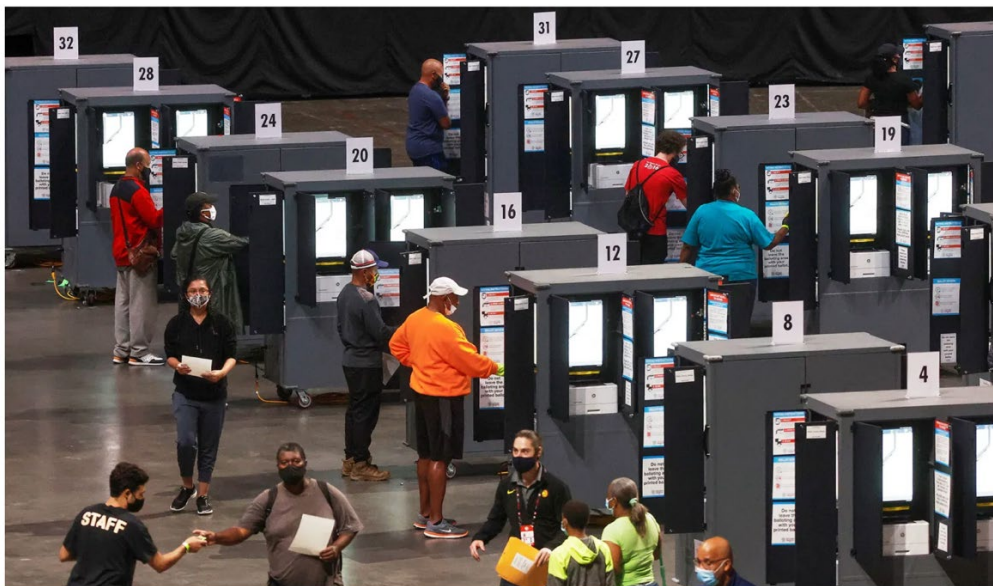
People cast their ballots during early voting for the presidential elections at State Farm Arena in Atlanta, Ga., October 12, 2020.

387. Figure 6 is a true and correct photograph of the inside of the State Farm Arena polling place in Fulton County, Georgia, taken in October 2020, during early voting for the General Election.