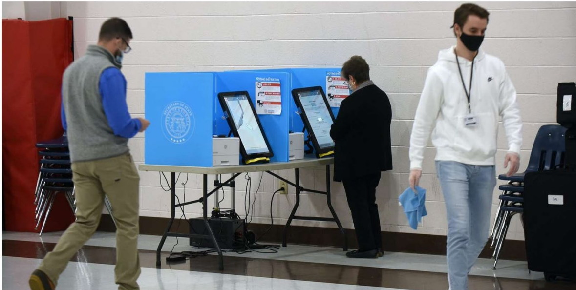
© Paul Hennessy/NurPhoto via Getty Images Voters are seen at a polling place at Varnell gymnasium on January 5, 2021 in Dalton, Georgia, USA. Paul Hennessy/NurPhoto via Getty Images