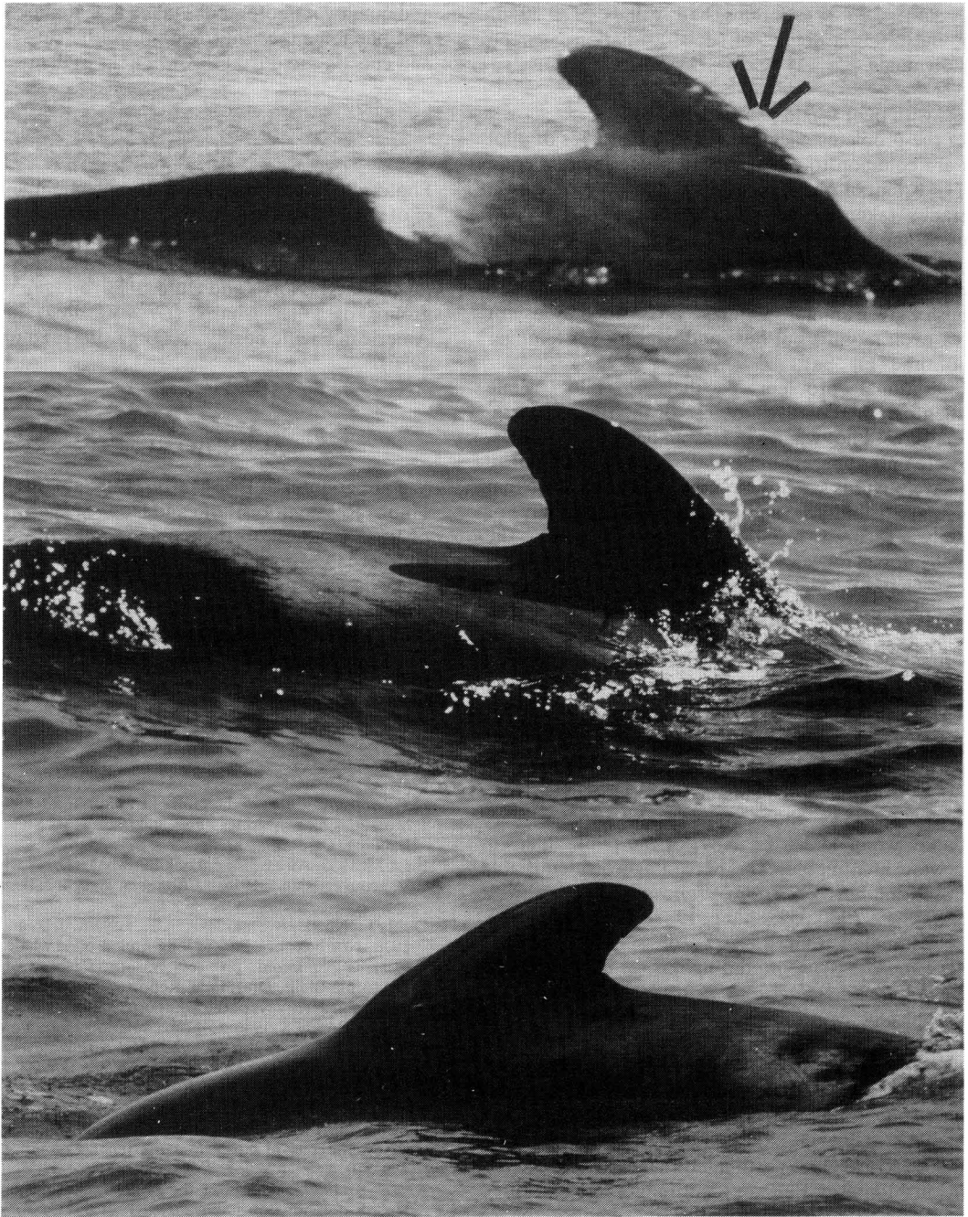
Fig. 3. Photographs of one identified pilot whale (Catalina ID, no. 34) which indicate some of the problems associated with photo-identification. (A) Image is out of focus, so nicks are indistinct and the dorsal saddle is fuzzy. Scratches on the leading edge of the dorsal fin healed and vanished over time (photo taken in December 1984). (B) Intensity of dorsal saddle diminished as compared with 1984 due to light conditions. Dorsal saddle partially obscured by dorsal fin shadow (photo taken in February 1986). (C) Pattern on left side of dorsal saddle is completely different from that on the right side (photo taken in February 1986).

two juveniles and one calf (3%). There were no data on the composition of the pod photographed off Palos Verdes Peninsula in December 1986.