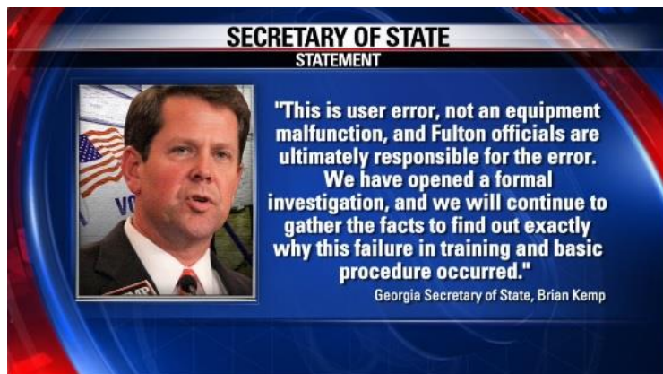
Exhibit 3: Sec. Kemp Call for Investigation

The scope of this analysis is election technology and scheduling and the SOS investigation will have little or no impact on these preliminary findings. The SOS investigation scope will not determine the true root causes of what happened on the April 18 th Election Night.