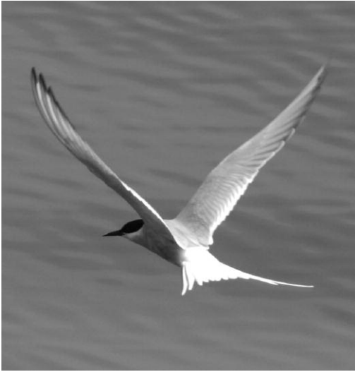
This image shows one of three Arctic Terns observed off the Kona Coast of the Big Island 27 April 2008. Arctics are probably regular spring and fall migrants in Hawaiian waters, but they are rarely observed.