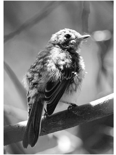
The Oahu Elepaio is an endangered subspecies of Elepaio found only on Oahu Island. This juvenile was one of two observed with their parents along busy Aiea Trail 24 April 2008.

breeding colony in s.-cen. Oahu. There were three reports on Oahu of Oahu Elepaio (Endangered): one at Kuliouou Trail 3 Mar (MW), 4 (2 ads. and 2 juvs.) at Aiea Trail 24 Apr (ph. MW), and one ad. and one subad. there 27 May (PD). Limited access to Waikamoi Preserve, Maui I. was reopened, allowing the observation of 2 Maui Parrotbills 7 & 27 Apr (DK). Tour groups were able to find Palila (Endangered) regularly in the heart of their range at Puu Laau Hawaii I. all season (HFT), but surveys have shown a decrease in the population over the past five years (PB). There were several reports of very small num-