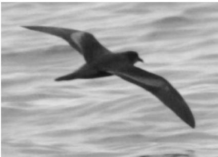
Bulwer's Petrels breed around the Main Hawaiian Islands, but good photographs of the species are rare. The light winds and calm winds prevailing off the Kona coast of the Big Island of Hawaii make it a bit easier to get images like this one, taken 3 May 2008.