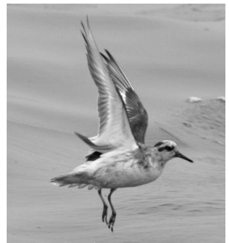
This Red Phalarope photographed 6 May off the Kona coast of the Big Island of Hawaii showed only a few traces of the red plumage that makes the adults so distinctive.