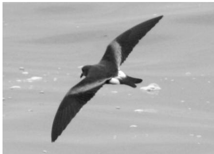
This photograph, taken 6 May 2008 off the Kona coast of the Big Island of Hawaii, nicely shows the forked tail and white rump with dark center of this Leach's Storm-Petrel. Leach's is regular in Hawaiian waters, assumedly as migrants, but the possibility of local breeding cannot be ruled out.