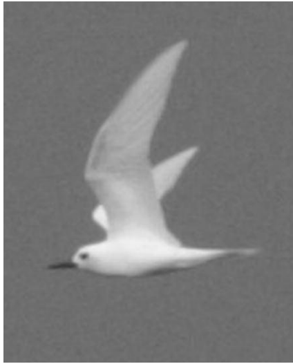
This photograph documents the rare occurrence of a White Tern off the Kona coast of the Big Island 13 May 2008. The only nesting records in the Main Hawaiian Islands are from Oahu Island, about 250 kilometers from Kona.