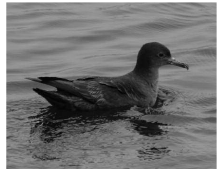
This photograph of a Sooty Shearwater was taken off the Kona coast of the Big Island of Hawaii 24 April 2008.