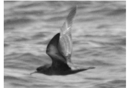
Sooty Shearwaters are frequently reported in Hawaiian waters, but it is often unclear if the birds are Sooty or Short-tailed Shearwaters. This photograph taken 19 April 2008 off the Kona coast of the Big Island of Hawaii clearly shows the long bill, sloping forehead, and distinct pale underwings characteristic of Sooty.

Region, were at Kealia 6 Mar (MN), and one or 2 others were seen at each of several locations, with the latest report of one at Palaaui, Molokai I. 23 May (ADY). A Franklin's and 2 Ring-billed Gulls were spotted at Kealia 6 Mar–1 May (MN), and another Ring-billed was at Sand I., Honolulu, Oahu I. 4 Apr (RJ). Single Arctic Terns were observed off w. Hawaii I. 20 & 27 Apr (ph. CRC). A Least/Little Tern was found at Moanalua Bay, Oahu I. 3 May (ph. DM) but specific identification could not be determined. Single Gray-backed Terns, rarely observed breeders in the Region, were s. of Oahu I. 17 Mar (GA, PD, DL et al.) and onshore at e. Oahu 7 May (MW). White Terns are locally common around Oahu I. but are seldom reported around the other main islands, so one off w. Hawaii I. 26 Apr, and 2 there 13 May (ph. CRC), were notable. The only Pomarine Jaeger reported was at Wailua Bay, Kauai I. 1 May (MG).