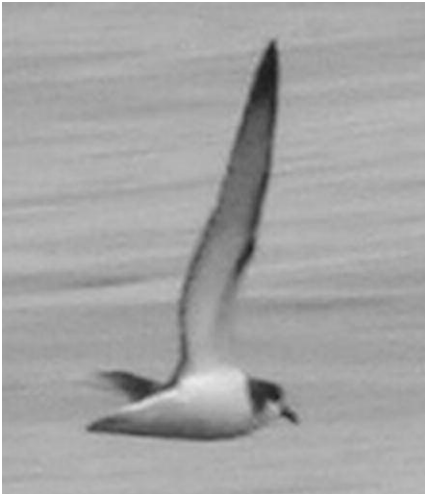
Gadfly petrels are notoriously difficult to photograph at sea, so it was great that both the dorsal and ventral sides of this Stejneger's Petrel were recorded off the Kona coast of the Big Island of Hawaii 14 May 2008. The dorsal view shows the dark "M" pattern and dark crown that contrast with the paler gray on the rest of the upperparts, while the ventral view shows the prominent dark half-collar extending well down onto the underside.