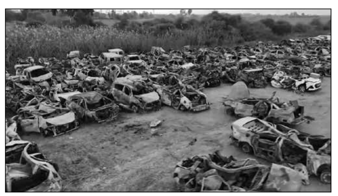
Above: Burned out cars at the Israeli rave party that appear to have been hit by high powered munitions

ISRAEL HAS used claims about Hamas' attacks on civilians on 7 October to justify its onslaught on Gaza. But it's now clear that a number of the civilian deaths were caused by the Israeli military.