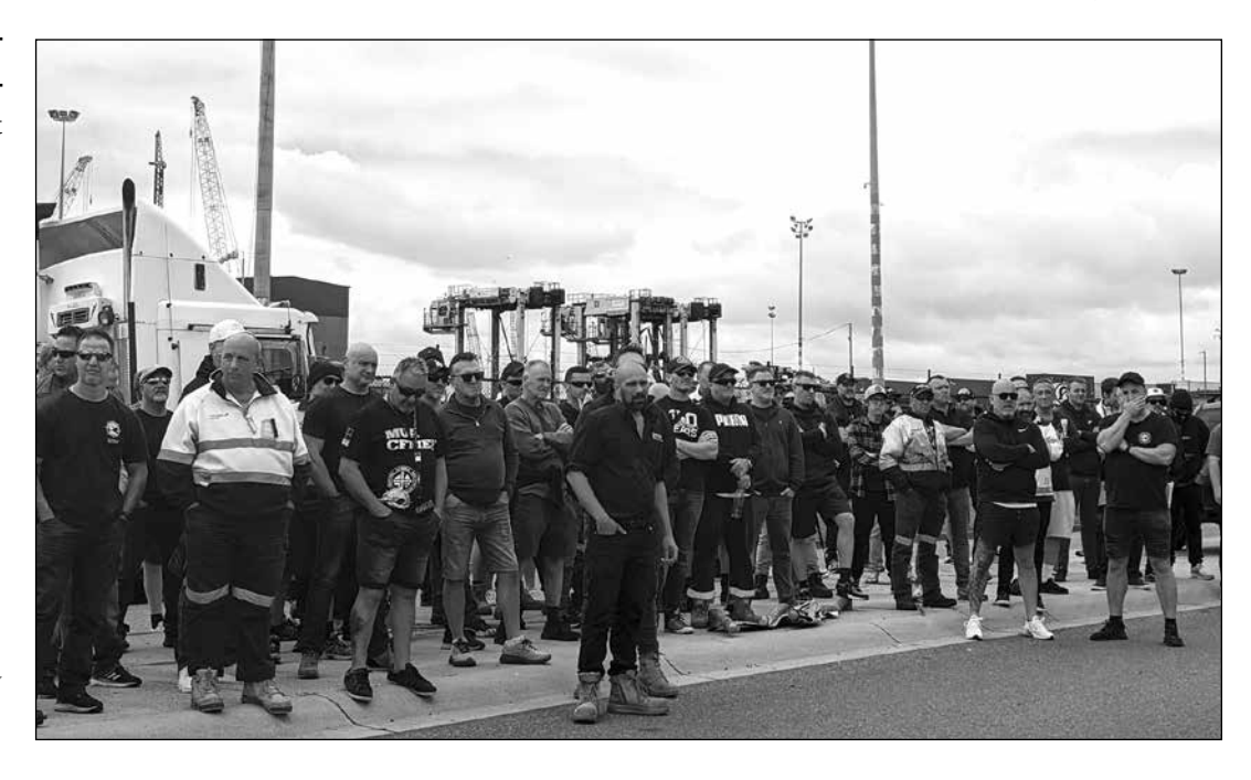
Above: Workers on strike at DP World in Melbourne

Many of DP's usual customers are contracting ships to Hutchison ports. Hutchison wharfies are less than