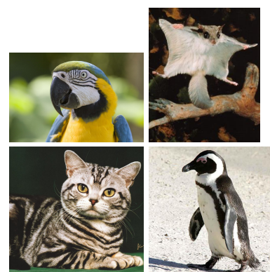
Figure 2.2: Test data for the same classification problem.

? It is also possible that the correct classification on the test data is ABAB. This corresponds to the bias "is the background in focus." Somehow no one seems to come up with this classification rule.