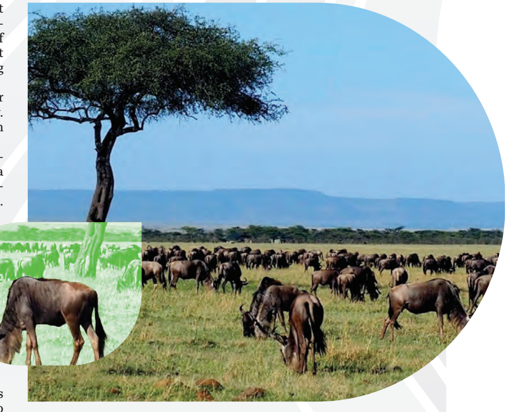
Scientists use GPS collars to study the movements of wildebeest across East Africa's grassland savannas SMITHSONIAN'S NATIONAL ZOO AND CONSERVATION BIOLOGY INSTITUTE

And in the air, scientists at the Zoo's Migratory Bird Center are piecing to-