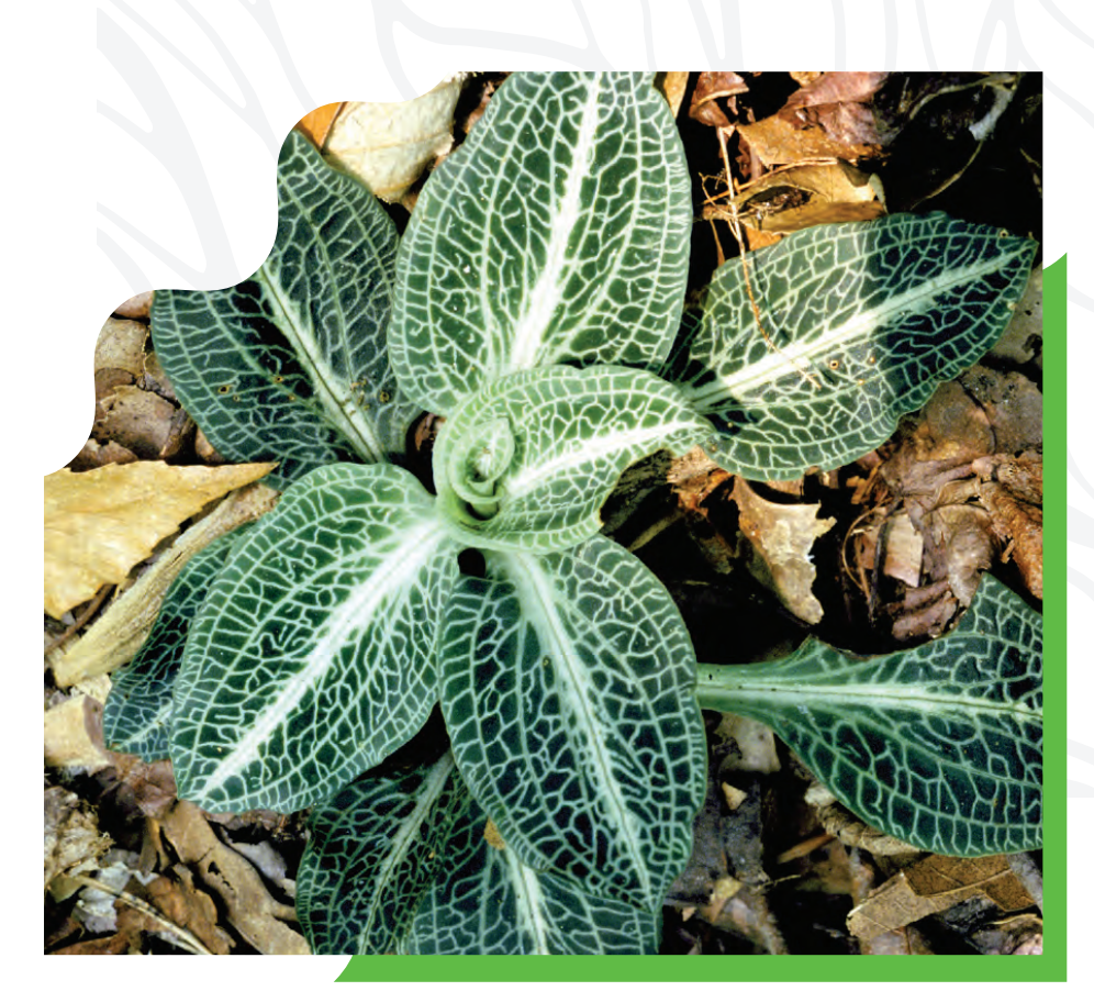
Downy rattlesnake plantain SMITHSONIAN ENVIRONMENTAL RESEARCH CENTER