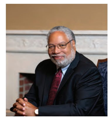
Lonnie G. Bunch III, Secretary of the Smithsonian SMITHSONIAN INSTITUTION

Since the Smithsonian was founded more than 175 years ago, it has been a scientific institution dedicated not only to learning about the natural world but also to helping sustain it for future generations.