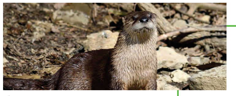
River Otter MATTHEW FREYER

Would you like to learn more about where disease outbreaks originate? Scan the QR code to visit the National Museum of Natural History's online exhibit entitled "Outbreak: Epidemics in a Connected World."