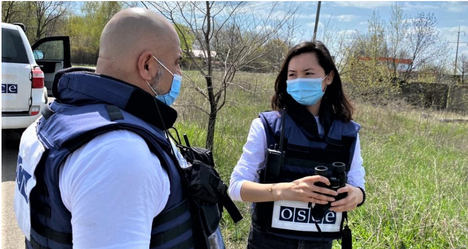
SMM monitoring officers in Horlivka, Donetsk region