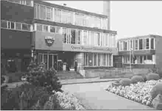
Fig. 3. Queen Margaret University College, Clermiston, 1970–2007.

After the Second World War students flocked to Atholl Crescent and the school's programme was revised and modernised. By 1950 there were 500 in full time courses and 4000–5000 part time students per year. By 1958 the corresponding numbers had risen to 600, with 5000 part time — including 24 from overseas. 42 The school was bursting at the seams and a new site was found at Clermiston, a few miles from the city centre, in the spacious grounds of a former mansion house. By 1965 a design had been chosen and in June 1971, three years after the foundation stone had been laid, the new establishment was formally opened, with fewer than 500 full time students in buildings designed for 900 (fig. 3). The syllabus needed to be completely rethought in the light of the rapidly changing social circumstances as so many of the traditional courses were now deemed inappropriate. As a result of moving away from its century-old core subjects a change of name was considered advisable and the title chosen was Queen Margaret College. 43