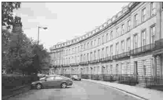
Fig. 1. Atholl Crescent, home to the Edinburgh School of Cookery, 1891–1970.

It has been written chiefly for the use of cookery classes in elementary schools. The theory of food is therefore explained in simple language, the recipes are given in small quantities, and the directions are very minute. It is hoped, however, that the book may prove useful also to others who desire to study the theory and practice of good economical cookery.