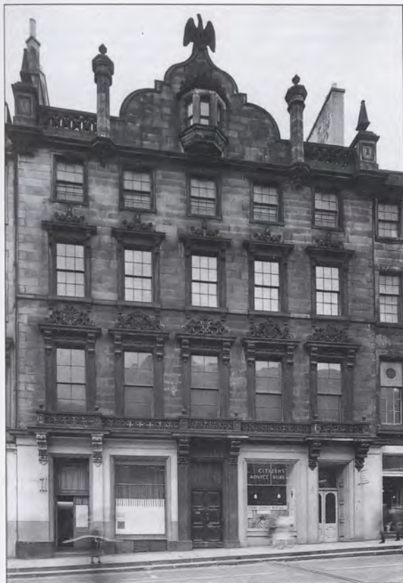
Fig. 3. Frontage to No. 7 Melbourne Place, 1965, showing the main entrance doorway, flanked on either side by shops. The Society's premises embraced the five windows on the first, second and third floors. The eagle, with spread wings, is mounted on the gable on the fourth storey.

The handsome group of buildings along Melbourne Place had been erected in 1835, following