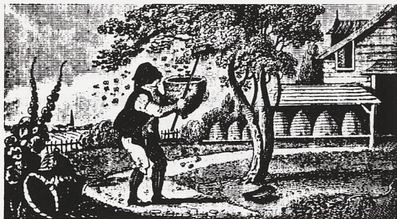
Fig. 1. Knocking the swarm out of a tree and into a skep. A neat row of skeps in the background. (From Scenes of Industry , London 1821)

Nowhere in the accounts does the terminology suggest that Sir John was making use of the new method of managing bees, as promoted by his compatriot, John Gedde of Falkland. Gedde had patented the first wooden beehive, forerunner of today's hives, in 1675 and had been commanded by King Charles II to set up apiaries using them not only in London and Windsor but also in Falkland, as an example for others to follow. 2 It would seem that Sir John was not sufficiently convinced of the advantages to take up either the new hives or the new style of management they required.