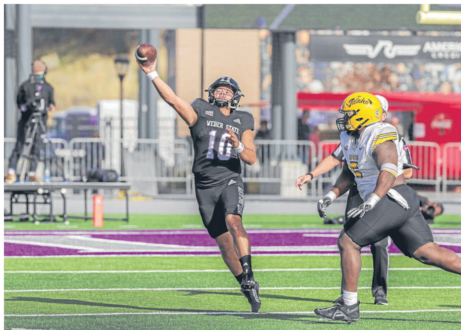
WEBER STATE ATHLETICS

The Vandals out-gained the Wildcats 418 to 291 in total yards but lost the turn-