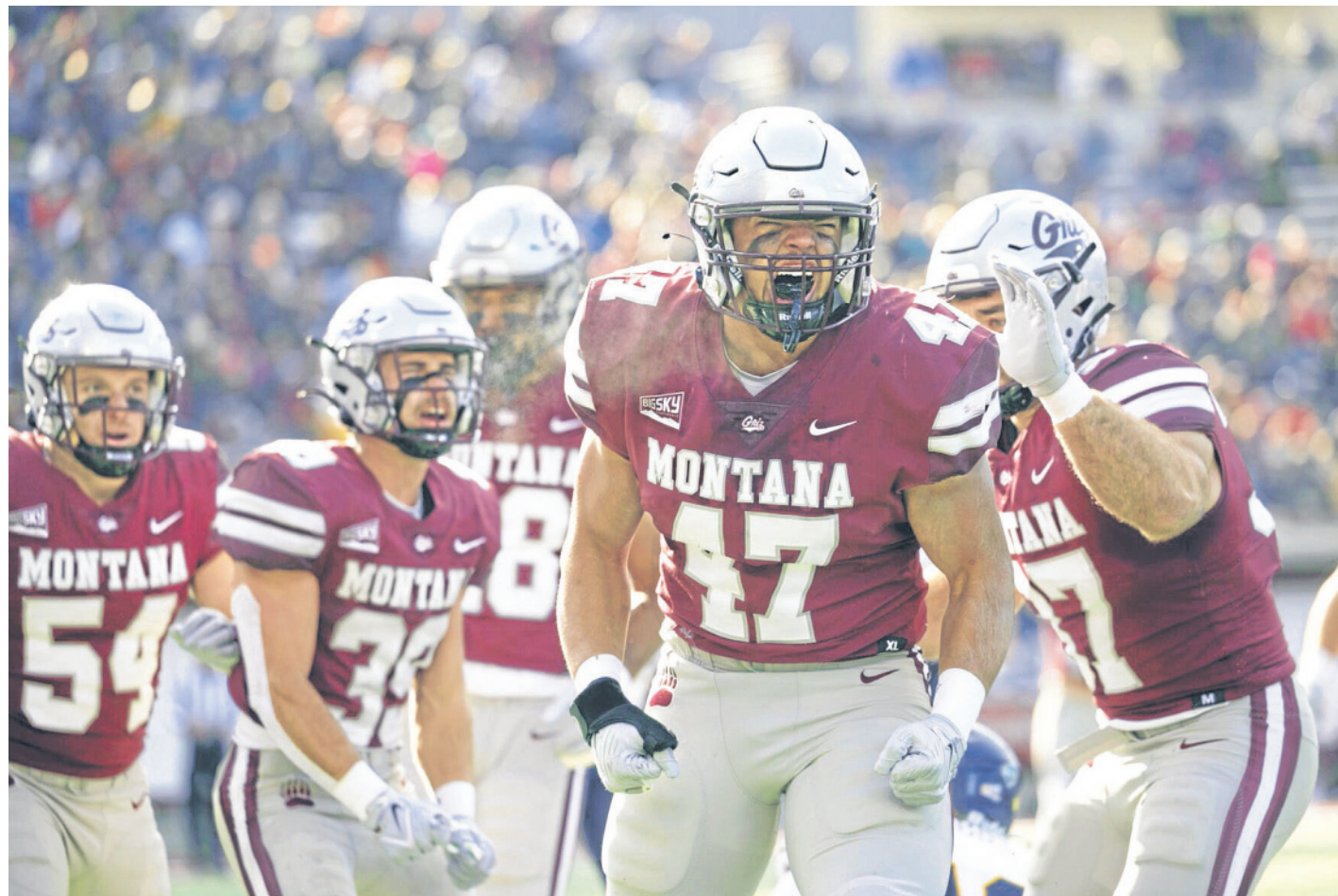
BEN ALLAN SMITH, MISSOULIAN

A: It's a lot different having to adapt to the traffic and the different kind of roadways. Some things that are similar is I feel the community here is very similar to Havre. It's all very close-knit. Everybody