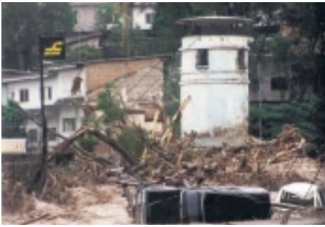
Hurricane Mitch strikes Honduras, October 1998