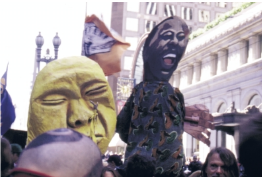
Ken Saro Wiwa puppet, International Day of Action Against Corporate Globalization, San Francisco

Of course, Climate Justice will not be achieved without the emergence of a powerful movement for grassroots globalization—one which links efforts for social and environmental justice across the globe. The good news is that such a movement is emerging.