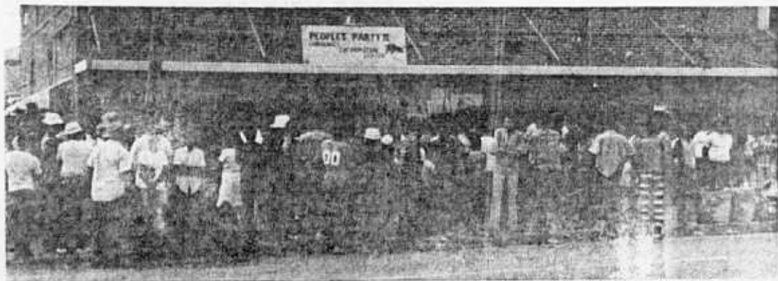
Peoples Party Rally, Wed., July 22.