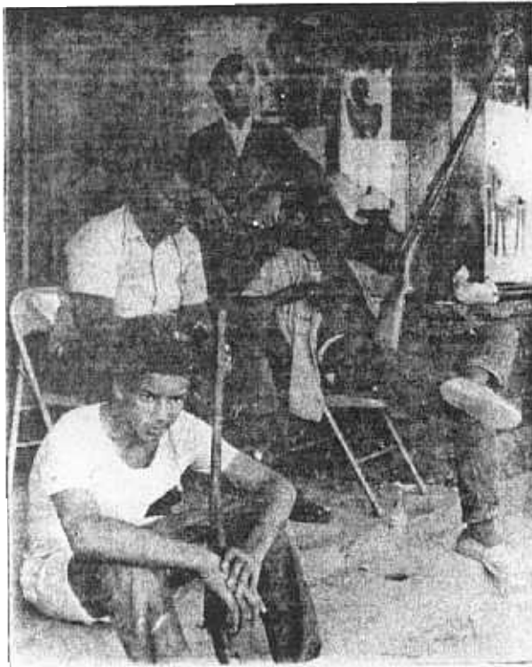
FFII brothers guard center.