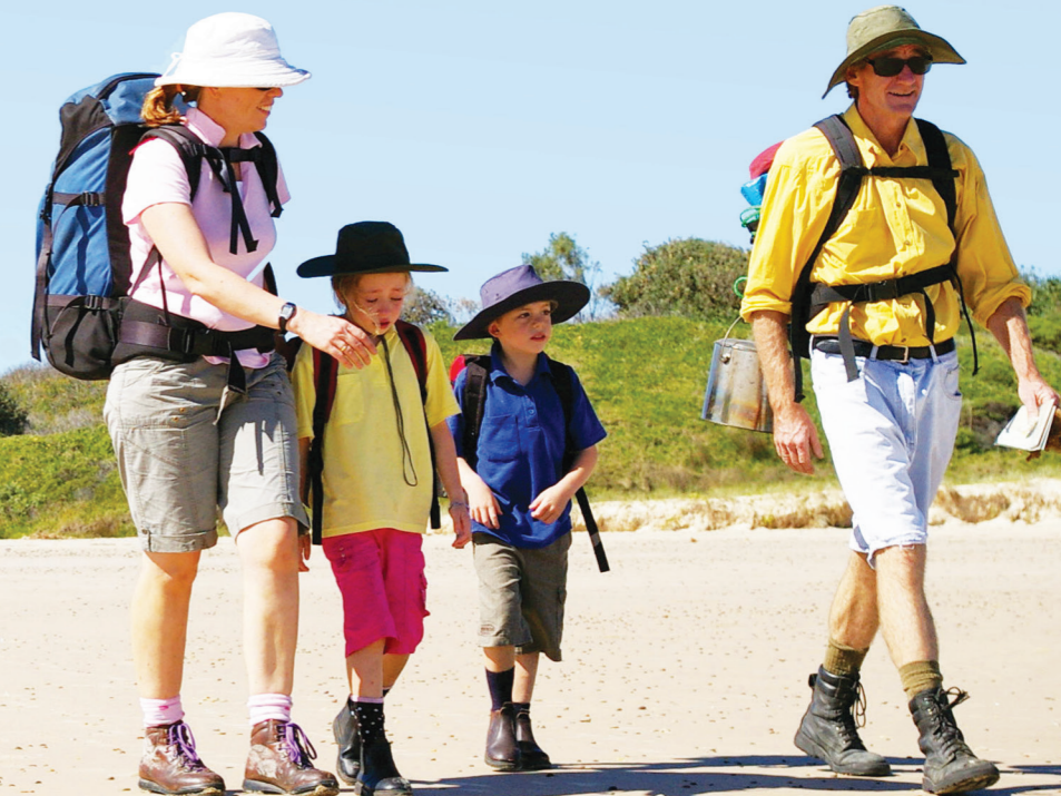
This family can use MetEye to plan their perfect day.

Current satellite image and link to descriptive text