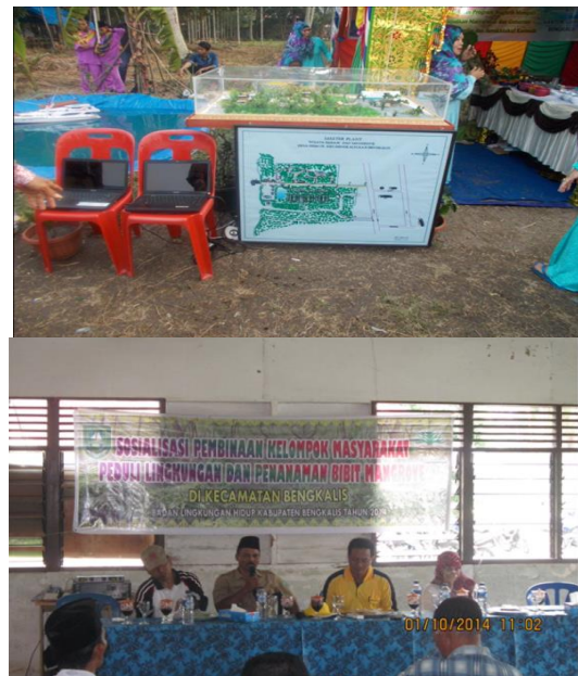
Fig. 1: Examples of Message and Communication Channels

conditions of the coastal waters in Bengkalis Regency which have been damaged due to abrasion. The environmental communication message was packaged in a documentary video about the process of managing the Kempas program, such as playing at the stand of the Environmental Service at the MTQ event in Selatbaru. The video presentation is to promote and form an environmental campaign. In addition, the Environmental Service Stand also featured physical sketches from the master plan for the mangrove ecotourism program.