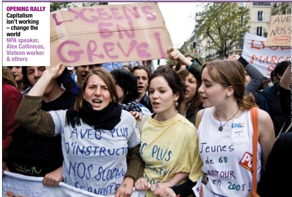
French school students demonstrate.