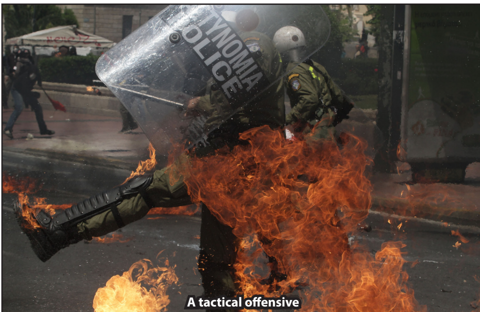
A tactical offensive

Strategic equilibrium is a stage of transformation, when qualitatively the revolution and the state have achieved a qualitative parity of forces and yet neither is capable of dispersing the other. There exists a condition of dual power, in which the proletariat has developed to some degree new organs of political power and social organization that are outside the control of the bourgeois state. This is the stage during which revolution has become the order of the day and the Party must practically prepare itself and the masses for decisive forms of struggle through new forms of organization and mass uprisings that will be "dress rehearsals" for the seizure of power. The bourgeoisie may choose to violate its own legality and pretense of liberal democracy and opt for increasingly violent and authoritarian solutions to the combating the revolutionary forces. The proletariat must work to politically disintegrate and split the standing army of the ruling class so that the bourgeoisie cannot assert its military superiority as well as ensure the protection and expansion of its own armed forces. During periods of rebellion the revolutionary forces must prepare for retreat as well as offensive so