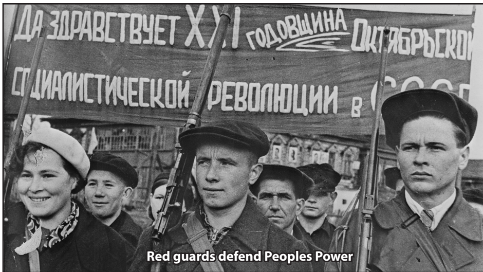
Red guards defend Peoples Power

that they do not over-extend themselves.