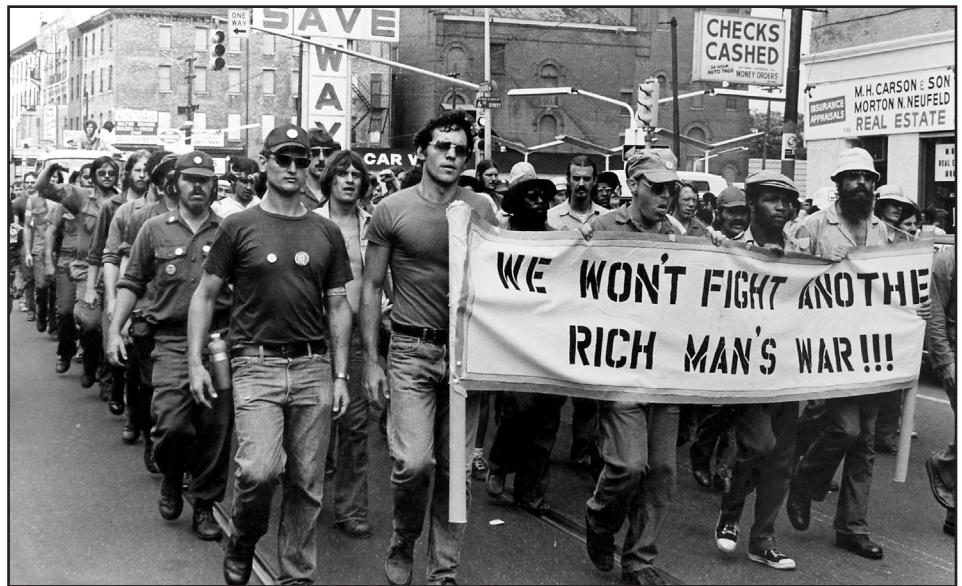
US Soldiers turn against US Imperialism

“In all the practical work of our Party, all correct leadership is necessarily ‘from the masses to the masses’. This means: take the ideas of the masses (scattered and unsystematic ideas) and concentrate them (through study turn them into concentrated and systematic ideas), then go to the masses and propagate and explain these ideas until the masses embrace them as their own, hold fast to them and translate them into action, and test the correctness of these ideas in such action . . . And so on, and over and over again in an endless spiral, with the ideas becoming more correct, more vital and richer each time.