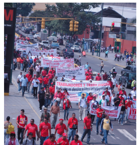
There are over 35 000 community councils in Venezuela and are directly undertaking over $2 billion worth of projects.

The strategy of building dual power should become a matter of consideration and debate amongst revolutionaries in Canada, including those that tend towards anarchism. There are many sincere and committed comrades out there, and the social conditions for organizing becoming more advantageous to our forces every day. However, while unity around resisting is coming along, we also need to create maximum unity around a strategy for building. Failure to do so will create space for our enemies of all stripes. Building unity amongst advanced forces should be a priority for all of us.