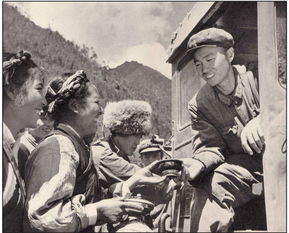
Peking Commune Swag

Despite the social/liberal democrats efforts to maintain confidence in the state, the gravity of the problems and the clarity of the contradictions are causing the people to search for solutions beyond those under official consideration. Their unwillingness to recognize class antagonisms and propose solu-