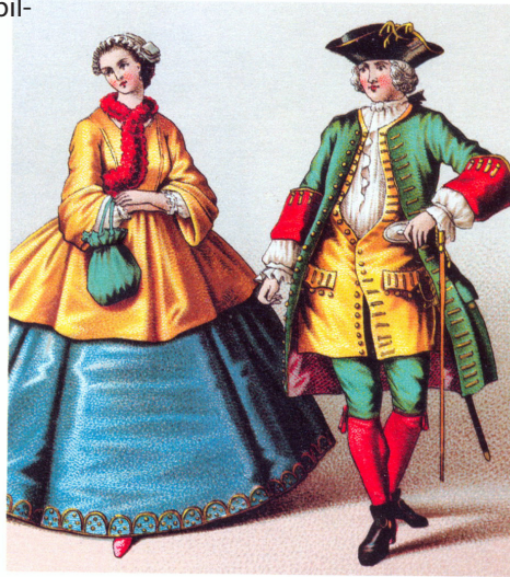
The bourgeoisie: what exactly did we ever have in common with them?

and education, are provided or administered through the City government. As with many urban centres in imperialist countries, state intervention in Canada at the City level have been used to facilitate the efficient and continued