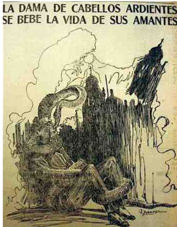
La Dama de los Cabellos Ardientes se bebe la vida de sus amantes, El Herald, July, 26, 1919.