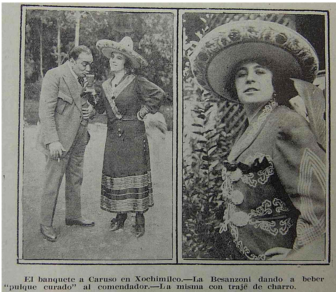
Caruso in Xochimilco (1919).