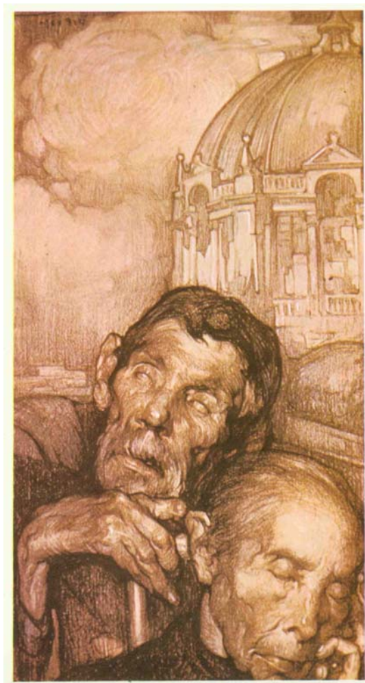
Painting by Saturnino Herrán.