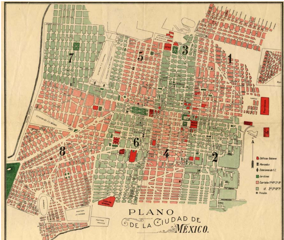
Map of Mexico City, circa 1919.

In 1919, Mexico City had not yet been totally reconstructed after the events of 1914 and 1915. But the streets of the old colonial city and the Porfirian Ideal City had returned to a vivid urban life. Rampant crime had declined, and political violence had become selective. By 1926 a US military attaché in Mexico informed authorities in the US that city security had improved greatly, that criminals were apprehended and killed, and that General Roberto Cruz,