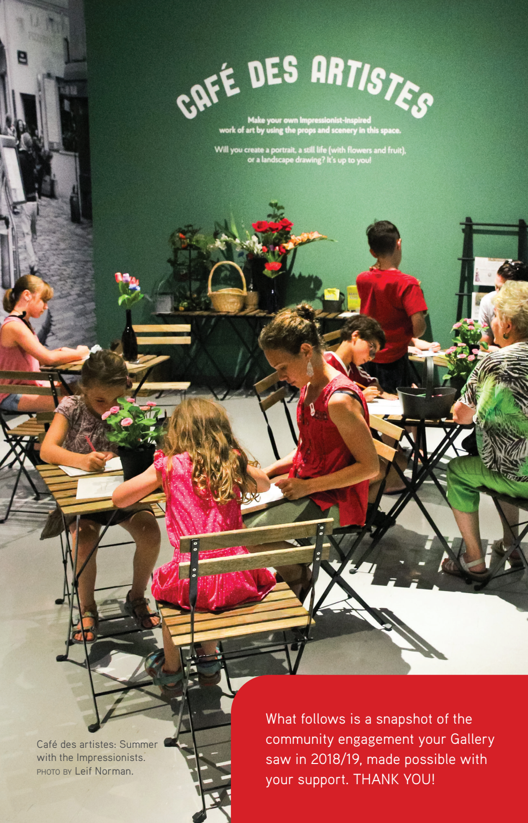
Café des artistes: Summer with the Impressionists.

What follows is a snapshot of the community engagement your Gallery saw in 2018/19, made possible with your support. THANK YOU!