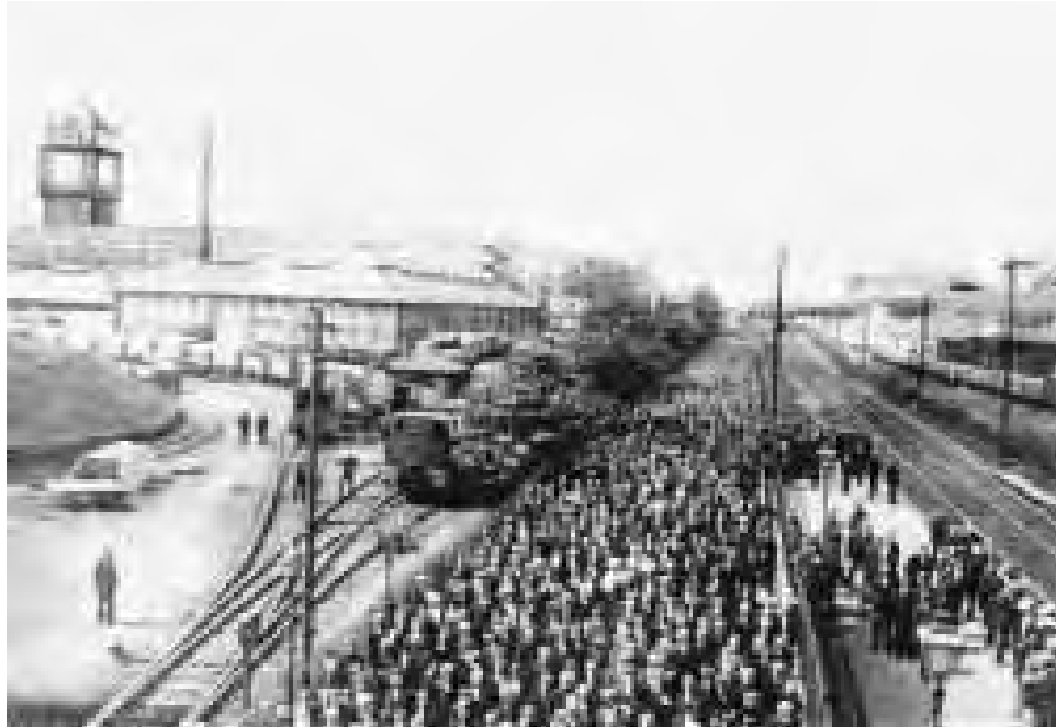
End of the workday at the Singer Works, Clydebank. (Circa 1910)

nals of industrialism, an attempt has been made, from various quarters, to lay the whole blame for the failure upon Industrial Unionism. Opponents of Industrial Unionism, capitalists and official trade unionists, have not concealed their delight at the defeat of these thousands of oppressed and sweated workers, on the grounds that their failure was calculated to discredit the