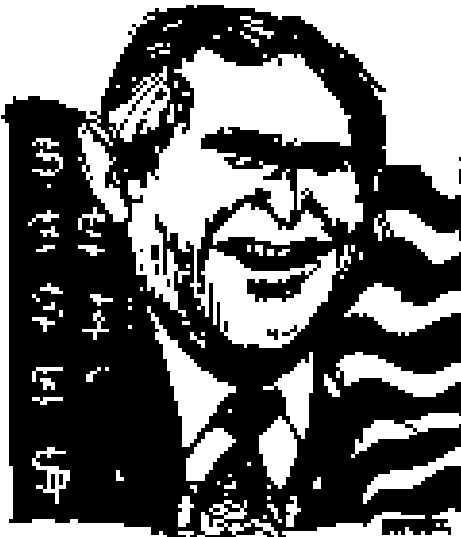
B.B. for The People

Clinton administration, a reflection of its cautious approach," the INC complained in a press release posted on its Web site on Feb. 7. "Clinton's national security adviser, Samuel Berger, once explained the administration's rationale by saying that if 'you encourage and almost incite people to rise up against their government, you incur a moral obligation to come to their defense at a moment of peril.'"