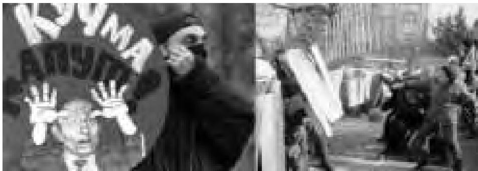
A demonstrator holds an anti-Kuchma placard during a December protest in Kiev to demand President Kuchma's resignation (left). Demonstrators and police clash in Kiev on March 9 (right).

Yesterday our organization participated in a protest picket line near the Ukrainian