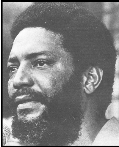
Grenadan Prime Minister Maurice Bishop (1979-1983)