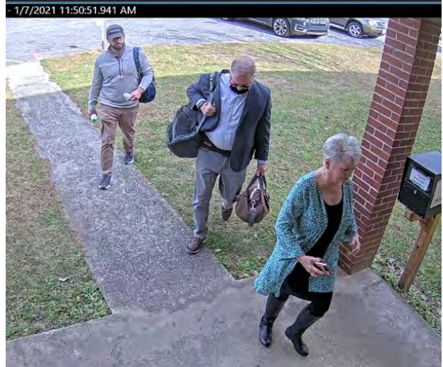
Jan. 7, 2021 11:50am Latham leads Hall & Cruce in with bags (Ex. 4 at 38.)