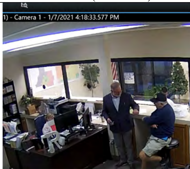
Jan. 7, 2021 4:18pm Hall stands beside Riddlehoover's desk. (Ex. 8 at 49.)