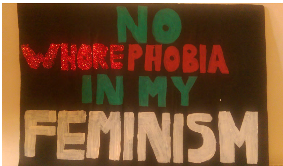
Sign realised by Glasgow Feminist Collective and Sex Worker Open University for a sex worker-inclusive bloc at Reclaim the night, Glasgow, 2015

Contrary to the core ideology of radical feminists, the 'sex work as work' perspective holds that sex work is a form of work. Within this perspective, there are – again – a number of different positions. Some simply think that sex work is work and should be treated like any other form of labour, citing that the only reasons it is treated differently is due to the illiberal moral approach towards sexuality. Others think that while sex work is as legitimate as any other form of work, there is an inherent problem with work in capitalist societies. That is, the fact that being forced to work in order to survive limits people's options, so work should be critiqued as a social institution. 'Sex-work is work' feminists differ in the degree to which they see sex work as something which may be empowering or an overall positive experience (sex-radical feminists), and those who think that sex work is largely a negative experience, similar to many other forms of precarious work under capitalism. Most agree that while prostitution is always work, all types of work are shaped by the classed, gendered and racialised social relations in which they take place. Similarly, most agree that sex work is complex and that sexuality and sexual activity can serve simultaneously as a site of exploitation and victimisation and as a site of agency.