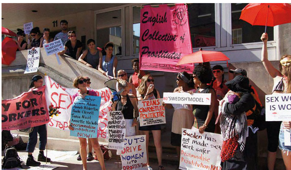
Protesters in front of the Swedish Embassy in London, in 2013.

The criminalisation of clients in Sweden furthermore has pushed sex workers underground and frequently forces them to operate in unsafe or clandestine conditions. This has resulted in sex workers being rendered more vulnerable to violence and harassment and affected by increased stigmatisation and discrimination. A report evaluating the effects of the Swedish Model, published in 2015 by the Swedish Association for Sexuality Education, RFSU, indicated a significant rise of negative attitudes towards sex work and sex workers. 31