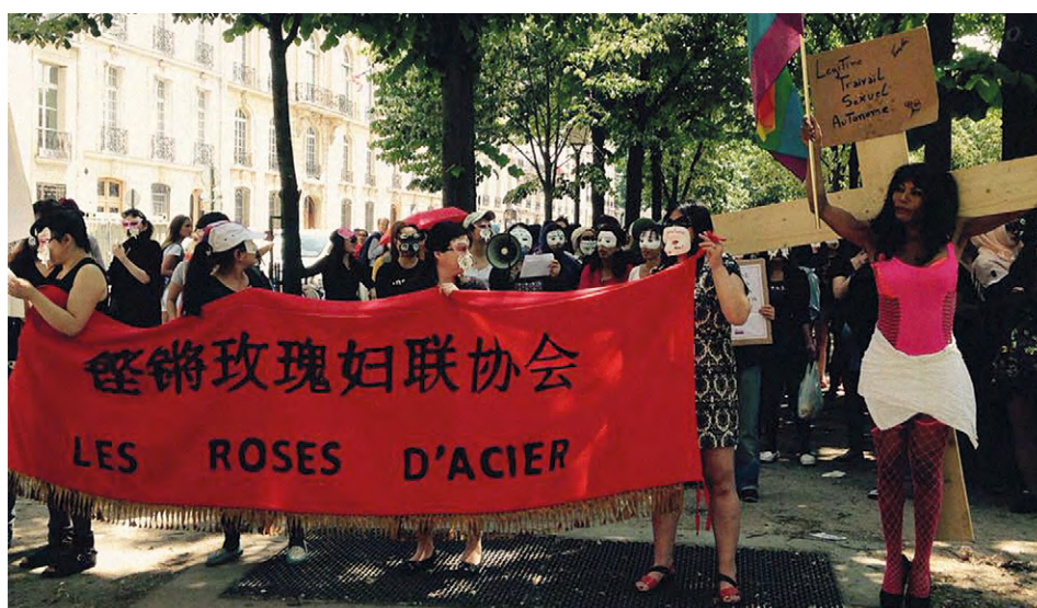
Les Roses d'Acier (Steel Roses), established in Paris in November 2014 by Chinese sex workers protest against the law proposal to criminalise clients of sex workers in front of the National Assembly.