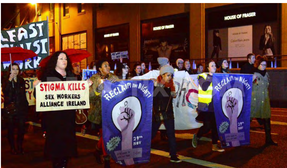
Sex workers and feminists protest against violence against women at Reclaim the night, Belfast, 2015

State parties to the Convention accept that its provisions override any conflicting national law and require national legislation to be brought into alignment with the aims and measures of the Convention. In implementing the Convention, states must not discriminate on grounds of gender identity, particularly when taking measures to protect the rights of victims. Thus, trans people, and particularly those affected by multiple discrimination (e.g. ethnic or migrant background), enjoy protection from the Convention.