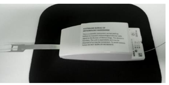
Photo 2 – Radiosonde, with Bureau label including how to dispose of radiosonde.

All of these items can be disposed of with normal household garbage and recycling. Do not burn or incinerate the radiosonde.