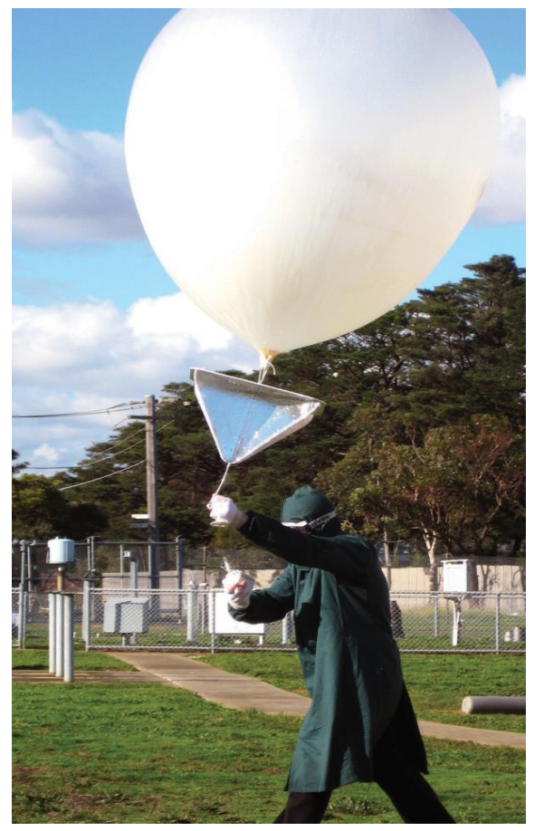
Photo 1 – Weather balloon and attachments, released by weather observer

Worldwide, weather balloons are released from approximately 1300 locations each day. The Bureau releases about 56 per day, or about 20,000 per year, from 38 locations within Australia and its offshore territories including Antarctica.