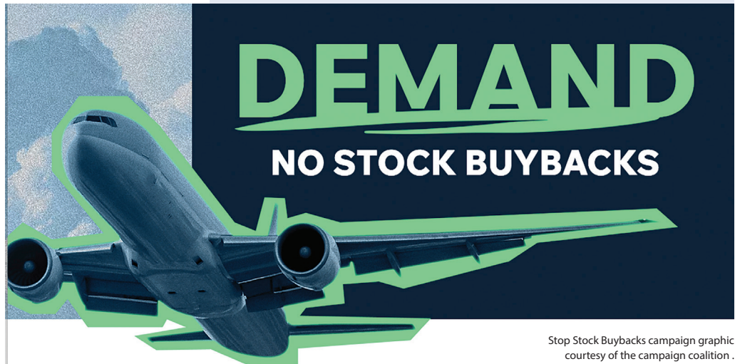
Stop Stock Buybacks campaign graphic courtesy of the campaign coalition.